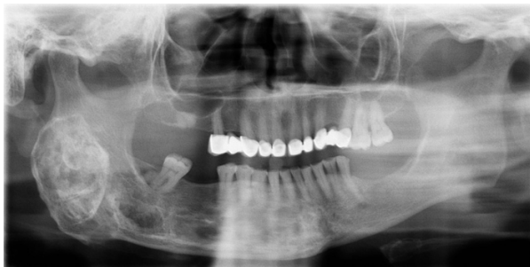
Fig. 1. Patient n°15. 26 years evolution mandibular FD. No significant clinical growth, stable and asymptomatic till date.

Lesions were most frequently found in the mandibular area in 11 of the patients (Figs. 1,2), in the maxillary area