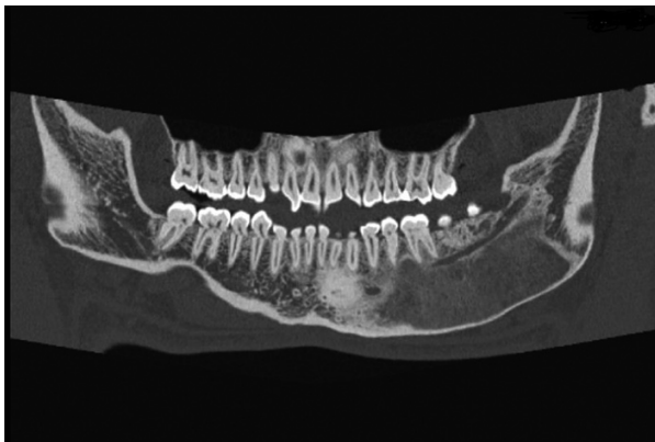
Fig. 2. Patient n° 4, mandibular FD diagnosed by an incidental finding in a radiological study, clinically asymptomatic.

in 4 of the patients, in the malar area in 2 of the patients (Fig. 3), with one patient presenting involvement of the parietal area. One of the patients showed conjoint mandibular and maxillary involvement. One case showed a polyostotic involvement which included the mandibular area and the long bones of the upper and lower limbs, with no evidence of endocrine or skin pigmentation alterations.