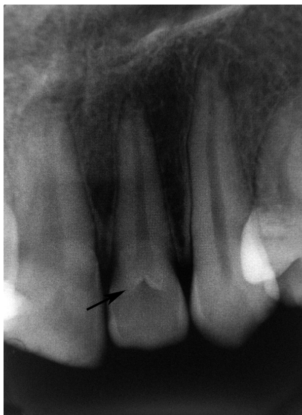
Fig. 1. Periapical radiography shows a type I dens invaginatus according to the classification of Oehlers (arrow shows dens invaginatus).

Radiographic examples of the different types of dens invaginatus are shown in (Figs. 1-3). Irregular widening of the periodontal ligament space and the presence of periapical pathosis in invaginated teeth were assessed using the 'Periapical Index' (9) based on radiographs taken at the time of referral to the clinic.