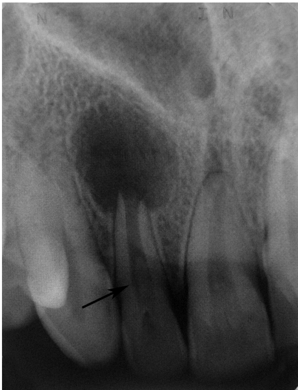
Fig. 3. Maxillary right lateral incisor with periapical lesion affected by Type III dens invaginatus (arrow).

All radiographs were reviewed in a dark room with an x-ray viewer (Illuminator 5000; RP Beard Ltd, London, UK) and evaluated independently by two examiners. A separate assessment of the radiographs was performed by each examiner, and the types of dens invaginatus were agreed upon according to the suggestions of the more experienced investigator. A final evaluation was performed, and a collective decision was made to determine whether or not the tooth had dens invaginatus and the type.