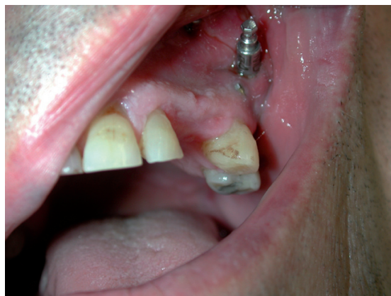
Fig. 1. Patient number 3 after lateral transport osteogenesis with adequate gingival tissues for implant placement.

Four patients with segmental defects after oncological resection were descriptively studied (mean age 55; range 41 to 62) (Table 1). The lateral bone transport technique was used to reconstruct the maxillary and mandibular bone defects in all cases: periosteum over the designed transport disk was preserved during the procedure to