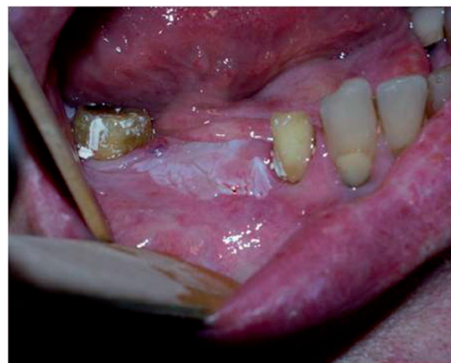
Fig. 1. Oral leukoplakia of the gums (before the surgical treatment).

In group 1, the lesions were excised with a cold knife including 3 mm of clinically normal mucosa at the periphery. In group 2, the lesions were excised with CO 2 laser in continuous mode, defocalized, with 15 mm of distance focus-lesion and a power setting of 5-15 W (5-15 seconds) (including, 3 mm of clinically normal mucosa at the periphery) (Figs. 1,2).