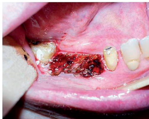
Fig. 2. Oral leukoplakia of the gums (immediately after the surgical treatment with CO 2 laser).