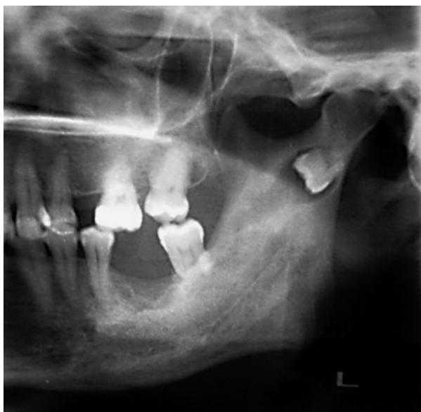
Fig. 1. Panoramic radiograph showing an inverted third molar associated with a radiolucent image in the left subcondylar region.

The new clinical case reported here was a 53 years-old woman who had suffered several episodes of intense pain and swelling in the left preauricular region accompanied by trismus, during the last year. The panoramic radiograph (Fig. 1) showed an ectopic third molar in