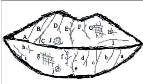
Fig. 1. Lip print classification of Renaud (25).

Renaud (25), which describes 10 types of lip prints (Fig. 1), designated by letters from A to J – capital letters being applied to the upper lip and lowercase letters to the lower lip.