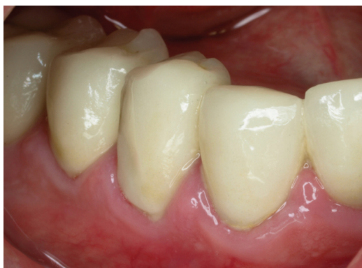
Fig. 3. Grade 2 of a zirconia full-coverage crown (Tooth 44).

Factors that reduce the strength of porcelain-veneered zirconia-based restorations and so increase the risk of chipping are: