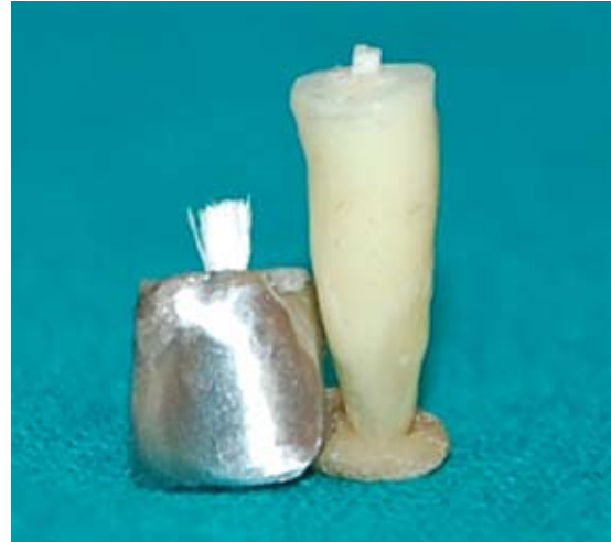
Fig 3. Mode of Failure in Glass Fiber Post and Composite Core System.

failure was not taken into consideration. Each specimen was then removed from acrylic resin block, polyvinyl siloxane coating was removed and mode of failure was recorded (Fig. 2, Fig. 3).