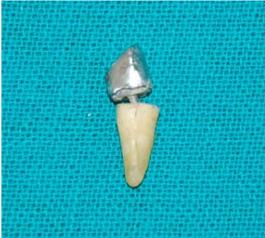
Fig 2. Mode of Failure in Cast Post and Core System.