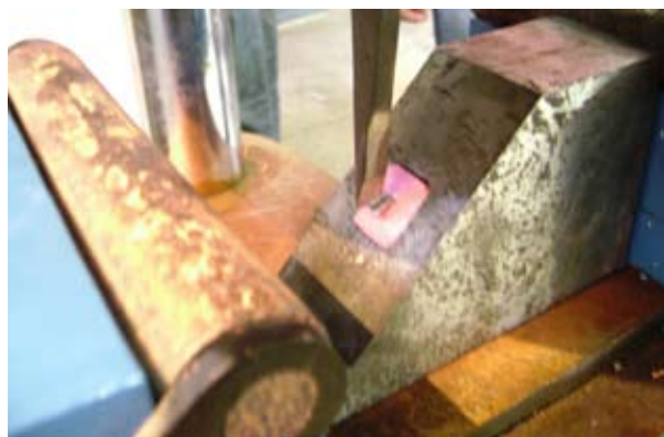
Fig. 1. Testing specimen on universal testing machine.