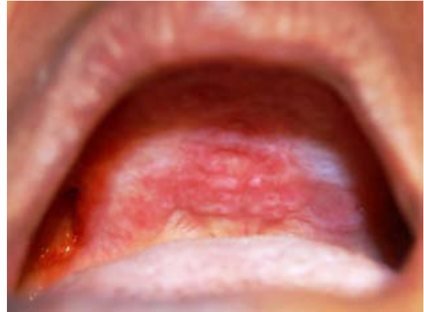
Fig. 1. Oral lesions in the hard palate and maxillary alveolar ridge.

Clinical examination showed severely resorbed maxillary and mandibular alveolar ridges. Erythema of hard palate, maxillary alveolar mucosa and distobuccal portion of mandibular alveolar mucosa bilaterally was present with foci of ulcerations (Fig. 1). On palpation mucosa over the hard palate was non tender, soft and oedematous in consistency with no discharge from the lesions. Noma was given as provisional diagnosis and tuberculous ulcer, ulcerative stomatitis secondary to malnutrition, chronic major aphthous ulcers and necrotising sialometaplasia were considered as differential diagnosis. Occlusal and panoramic radiograph, routine blood investigations, test to rule out tuberculosis and HIV and incisional biopsy were carried out. Panoramic radiograph revealed extensive bony destruction in