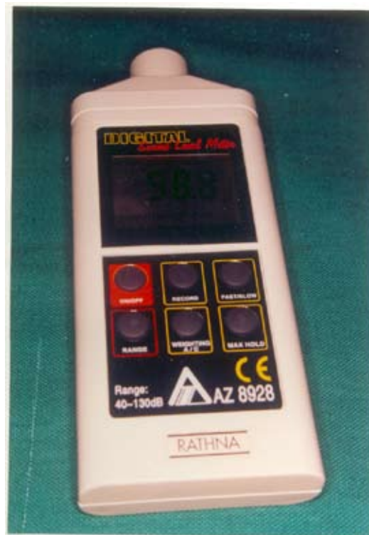
Fig. 1. Decibulometer or Sound Level Meter used to measure noise emitted by different dental equipments.

“decibulometer” or a “sound level meter” (Fig. 1) with a mounted microphone directed towards the source of sound in different teaching and learning areas. In each area the noise level was assessed at two positions-one, at 6 inches from the operators ear to simulate the noise reaching the ear drum and second, at the chairside instrument trolley to simulate the noise reaching the person standing nearby, although in decreased intensity. The purpose was to find out the noise levels in the immediate vicinity of the working area of the operator. This standardized instrument was obtained from the Manipal Institute of Technology, Manipal. The investigator was calibrated by training sessions in the correct use of the decibulometer from the concerned personnel of the Manipal Institute of Technology, Manipal. At all times, the decibulometer was used according to manufacturer’s recommendations.