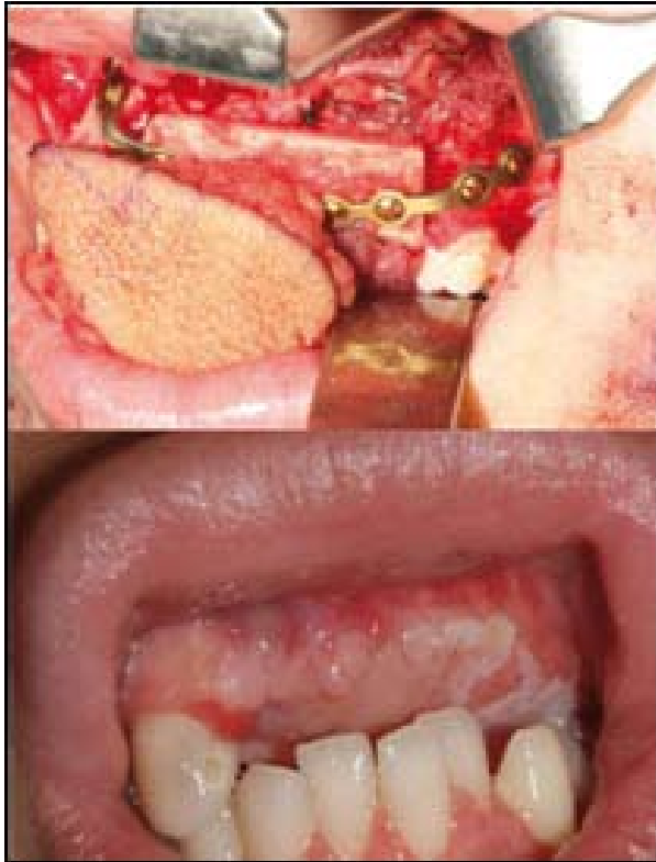
Fig. 3. a Adaptation of microvascular fibula free flap skin paddle associated to the resultant defect after excision. b Appearance of the flap once thinned two months after the reconstructive surgery.

As for handling, typically resorted to surgery, from simple curettage to resection of the lesion. After the surgical treatment has a high rate of recurrence (between 13-49%) (6). Currently calls for a conservative therapeutic, that prevents or diminishes the aesthetic and functional sequelae caused by standard treatments. So basically include three lines of conservative treatment. The most used is the intralesional injection of corticosteroids, with different guidelines and protocols, of which the most widespread in the literature is the weekly injection of triamcinolone (7) associated with local anesthetic for a period six weeks. Other conservative options are the use of calcitonin (8) (usually in the form of nasal spray) or interferon- \alpha (INF- \alpha ) (4,8), both in pattern of several months, depending on the success in reducing the granuloma. Occasionally, due to the high recurrence rate or incomplete disappearance of GCGs with conservative treatment is necessary to supplement the treatment with surgical removal of the same, and if possible, reconstruction of the defect created, for example with buccal fat pad flap (9) or microvascular free flaps, such as the fibula. Whatever the method chosen, it is essential to clinical and radiological control of the patient, through revisions and imaging testing (mainly CT).