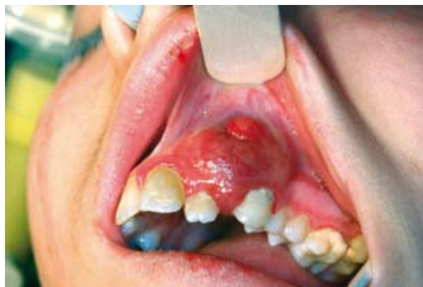
Fig. 2. Appearance of the lesion after conservative treatment with intralesional triamcinolone.

pieces 18, 28, 38 and 48 included and root fragments of pieces 16 and 36, and periapical lesions in relation to pieces 36 and 37. When patient is attended in consultation, a facial, axial and coronal computed tomography (CT)-scan and 3D reconstructions are requested (Fig. 1b), which shows the defect displayed on the Orthopantomography. In Hematoxylin-eosin staining appears intense proliferation of fibroblasts and multinucleated giant cells, and it is reported as “giant cell granuloma.” Based on the age of the patient, in the absence of clinical and benign nature of the lesion, we opted for conservative treatment by six cycles of intralesional injection of triamcinolone, with the further implementation of regular radiological controls. However, due to the persistence and escalation of the lesion (Fig. 2), we completed treatment with resection of the granuloma and reconstruction of the defect with microvascular fibula free flap with skin paddle associated by anastomosis of the peroneal vessels to the facial vessels (Fig. 3a). In a second procedure, two months after reconstruction, the flap was defatted (Fig. 3b).