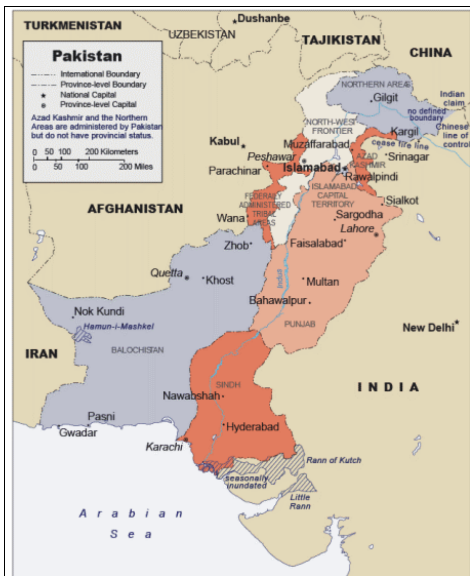
Figure 1. Map of Pakistan