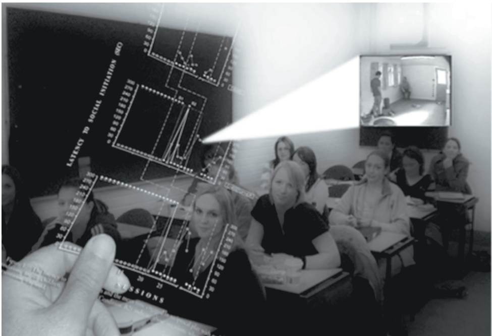
Figure 3: Clickable data points that show movies

This image, then, suggests how the BL instructor's teaching can be transformed with the integration of new and old media in a meaningful way. To proceed a step further, imagine how teaching assignments would change if articles from research journals could be downloaded wherein all the data points in the results section could be clicked to show video clips of procedures and actual behaviour. That would surely help in the dissemination of good practice as well as support critical and reflective thinking skills (see Keenan, 2010, pp. 21-23).