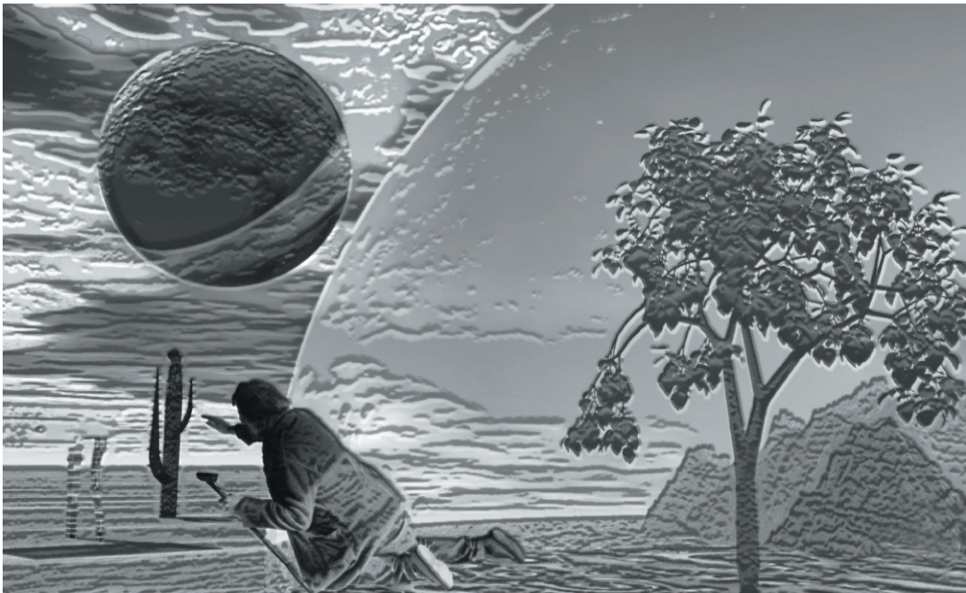
Figure 2: The Celestial Sphere

The image in Figure 3 provides an example of how interactive media can be used in combination with written media to train would-be therapists in the principles and application of behaviour analysis. Consider that the learning environment provides opportunities for the