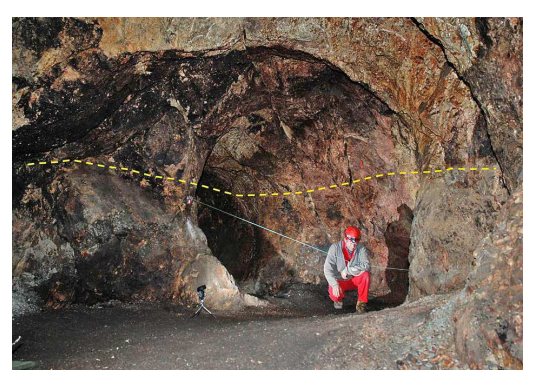
FIGURE 2. The "great hall" of the pit MaukE. The dashed line marks the level of already removed deposits which belong to modern mining activities.

Norway spruce ( Picea abies ) or stone pine ( Pinus cembra ) samples were available for dendrochronological dating. AMS-Radiocarbon dating (at the Vienna Environmental Research Accelerator laboratory -VERA- Institute for Isotope Research and Nuclear Physics of the University of Vienna) was used for a first estimation of the time range of the MaukE charcoal samples.