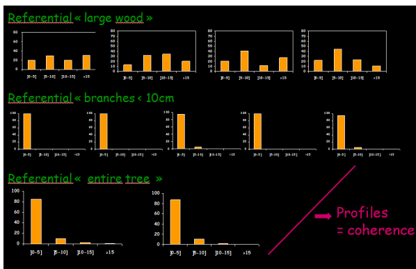
FIGURE 2. Profiles of histograms from experimental referential.

In order to verify that charcoal analysis allows discriminating wood batches of different calibers after their combustion, ten experimental combustions of pine wood ( Pinus pinaster ) were undertaken: three fires of big trunk bases (up to 30 cm), 5 fires of medium diameters (10 cm), 2 fires with a complete tree of variable calibers. A total of 4500 charcoals superior to 4 mm were measured with image analysis software. Four classes of calibers have been registered: [0-5 cm], [5-10 cm], [10-15 cm], [ > 15 cm]. First, we observed that the results of the replica of a same experiment are comparable. As the profile of the histograms shows, the classes of the measured calibers are represented in the same proportions (Fig. 2). But they don't correspond to the initial diameters of the wood that has been burned. Even though, the measured caliber classes are sufficiently different and reproducible to be discriminated through factorial analysis. This analysis allows discriminating the three experimental batches of wood: small calibers (10 cm), large calibers ( > 30 cm), and the complete tree. This statistical model would allow identifying the calibers of archaeological charcoal.