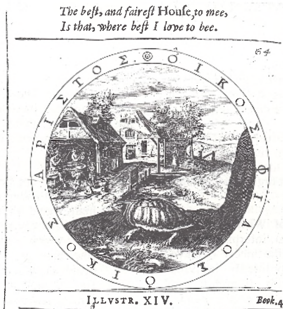
Fig. 1. " OIKOS PHILOS, OIKOS ARISTOS " (G. Wither, Collection of Emblemes , 1635).

I. ar'is-toc'ra-cy (from the Greek aristokratia , from aristos , best + kratein , to be strong,