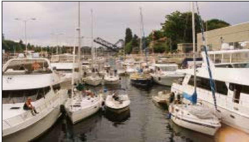
Figure 2. Pleasure Boaters Awaiting Free Lock Passage Through the LWSC

Another example of an expensive canal of little use to shippers is the Lake Washington Ship Canal (LWSC) that connects the Puget Sound with Lake Washington. Although located in Seattle, no shippers use the canal because all of the Port of Seattle's cargo terminals are located on the Sound, thus ships have no reason to transit the canal. The canal's cargo traffic is limited to intraport barge movement of sand and gravel, but it has cost HMT taxpayers $63 million to maintain over the last ten years which, like Grays Harbor, is tens of millions more than the costs to maintain the Ports of Seattle and Tacoma shipping channels combined. On a daily basis, an average of 100 pleasure boats (see Figure 2 below), transit the canal, accounting for about 82% of the canal's traffic. (Boaters prefer to dock in freshwater as there are no tides to contend with). Based on the number of vessels of all types that have transited the canal over the last decade (538,135 vessel transits), each vessel would have to pay $117 per transit if the maintenance costs were to be recovered from the canal's users. This indicates the nominal value that shippers are providing recreational boaters each time they pass through the canal. If recreational boaters were charged a fee based on the size of their boat, some say, it could correlate well with their lock usage and likely their ability to pay.