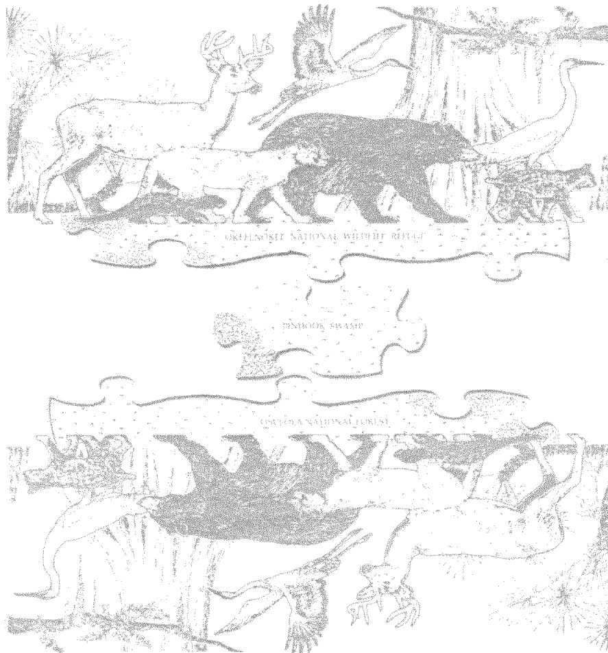
Source: Illustration by M. R. Clark, copyright 1990 Defenders of Wildlife, printed with permission.

Pinhook Swamp corridor purchased by The Nature Conservancy and the USDA Forest Service to provide a 15-mile land bridge between Okefenokee National Wildlife Refuge in Georgia and the Osceola National Forest in Florida.