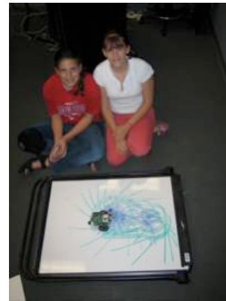
FIGURE 2 STUDENTS HIGHLIGHTING THEIR COLLABORATIVE EFFORTS IN USING THE ROBOTS.

In order to ensure that there were sufficient numbers of women participating in the camps, we embarked on an aggressive recruitment plan. We believed that the BEST Robotics program was one of our greatest sources for potential participants. The BEST Robotics program, conceived and launched by engineers at Texas Instruments, held its first competition in 1993. The program has grown steadily, expanding beyond Texas into 11 different states, with over 6000 students competing in 27 local events. UNT's hosting of a site provided a great opportunity to recruit young women who participated in this event. In addition, representatives from the Girl Scouts of the Cross Timbers Council (GSCTC) had agreed to work with us in advertising and promoting the robotics camps. Currently, 172 ninth through eleventh grade women participate in the GSCTC, and GSCTC's overall recruitment efforts extend to all North Texas area schools with a potential audience of 11,000 women. The Cross Timbers Council assisted in recruiting eligible participants from the other Girl Scout councils in the Dallas-Ft. Worth metroplex, and helped with some of the administrative duties. Finally, we