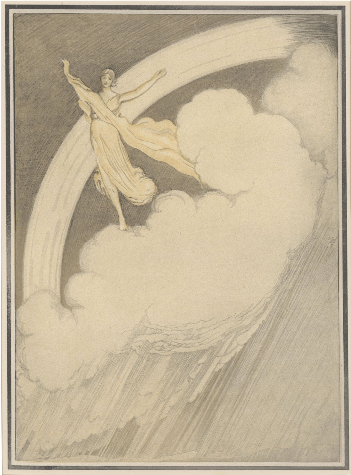
Figure 4. "Untitled", drawing by Edward Gordon Craig, 1906. From Isadora Duncan: Sechs Bewegungsstudien, Insel Verlag, 1906.