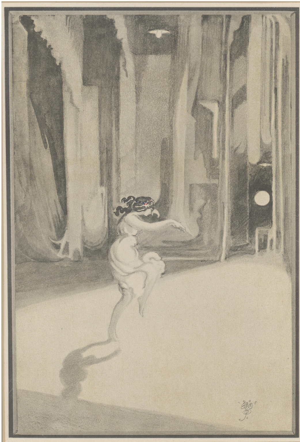
Figure 3. "Gluck", drawing by Edward Gordon Craig, 1906. From Isadora Duncan: Sechs Bewegungsstudien, Insel Verlag, 1906.