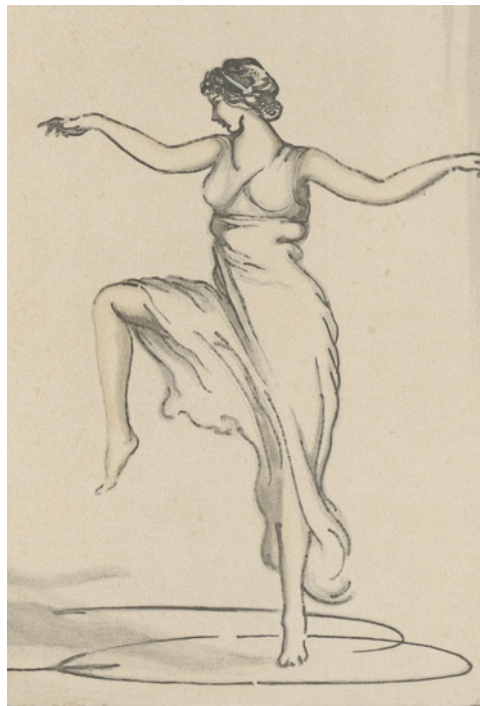
Figure 1. “Beethoven”, drawing by Edward Gordon Craig, 1906. From Isadora Duncan: Sechs Bewegungsstudien , Insel Verlag, 1906.

Lori Belilove: In Craig’s drawings [a series of six published in 1906], he is certainly astute about Isadora’s dance, specifically the physical power and playfulness. His drawings and watercolors speak volumes to his understanding and appreciation of her art. In the one titled “Beethoven” [Figure 1] he shows the specific Duncan knee lift, and the way the arms float in the air supported by the solar plexus. He also shows the way the tunic fabric moves around the dancer like the wind.