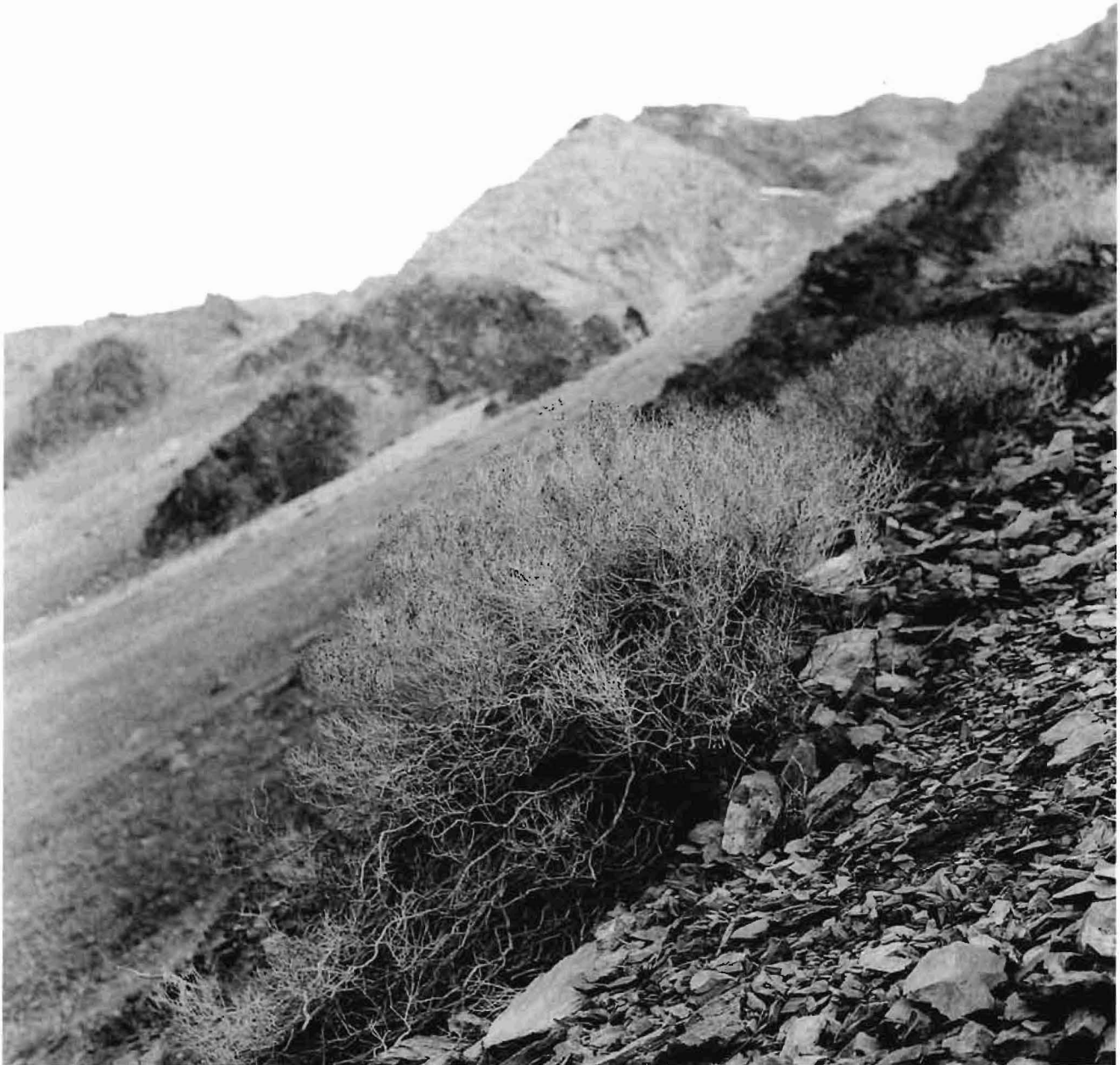
Fig. 1.— Dedeckera eurekensis growing at Coldwater Canyon, Inyo Mountains, California.

limiting. For Dedeckera the removal of 80% of the flowers on inflorescences and the removal of all but one flowering shoot from a rootstock did not significantly increase S/O ratios in Dedeckera (Table 2). Similar experiments, under greenhouse conditions, on Cirsium Mill. and Erigeron L. (Asteraceae) also produced no differences in S/O ratios between control and experimental plants with varying levels of inflorescence removal (Lalonde and Roitberg 1994; Allphin et al. 2002).