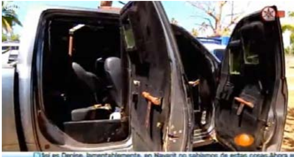
(1) En Orizaba, lamentablemente, en Navarrit no sabemos de estas cosas. Ahora se