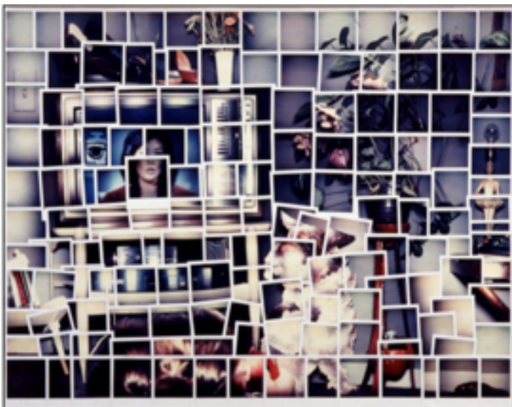
Joyce Neimanas, TV and Dog (#4). 1981. SX70 Polaroids, paint 40 x 32 in.