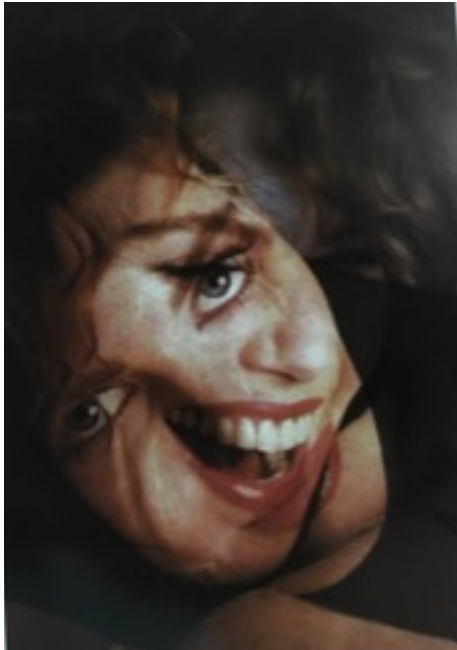
Robert Heinecken, Recto/Verso #3 . 1988. Silver dye bleach print.