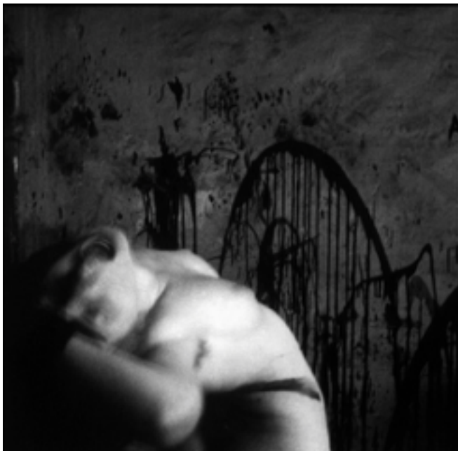
Francesca Woodman, Untitled . New York, 1979-80. Gelatin silver print, 14.6 x 14.6 cm.