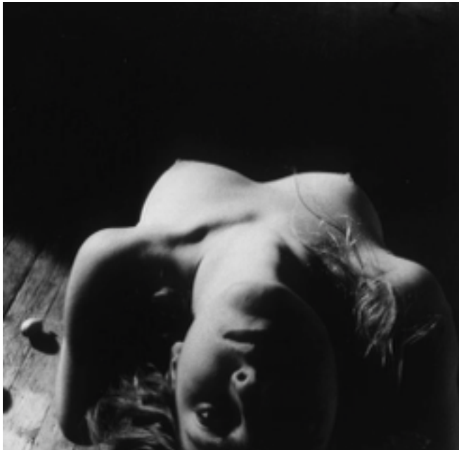
Francesca Woodman, On Being an Angel . Providence, Rhode Island, 1977. Gelatin silver print. 13.3 x 13.7 cm.