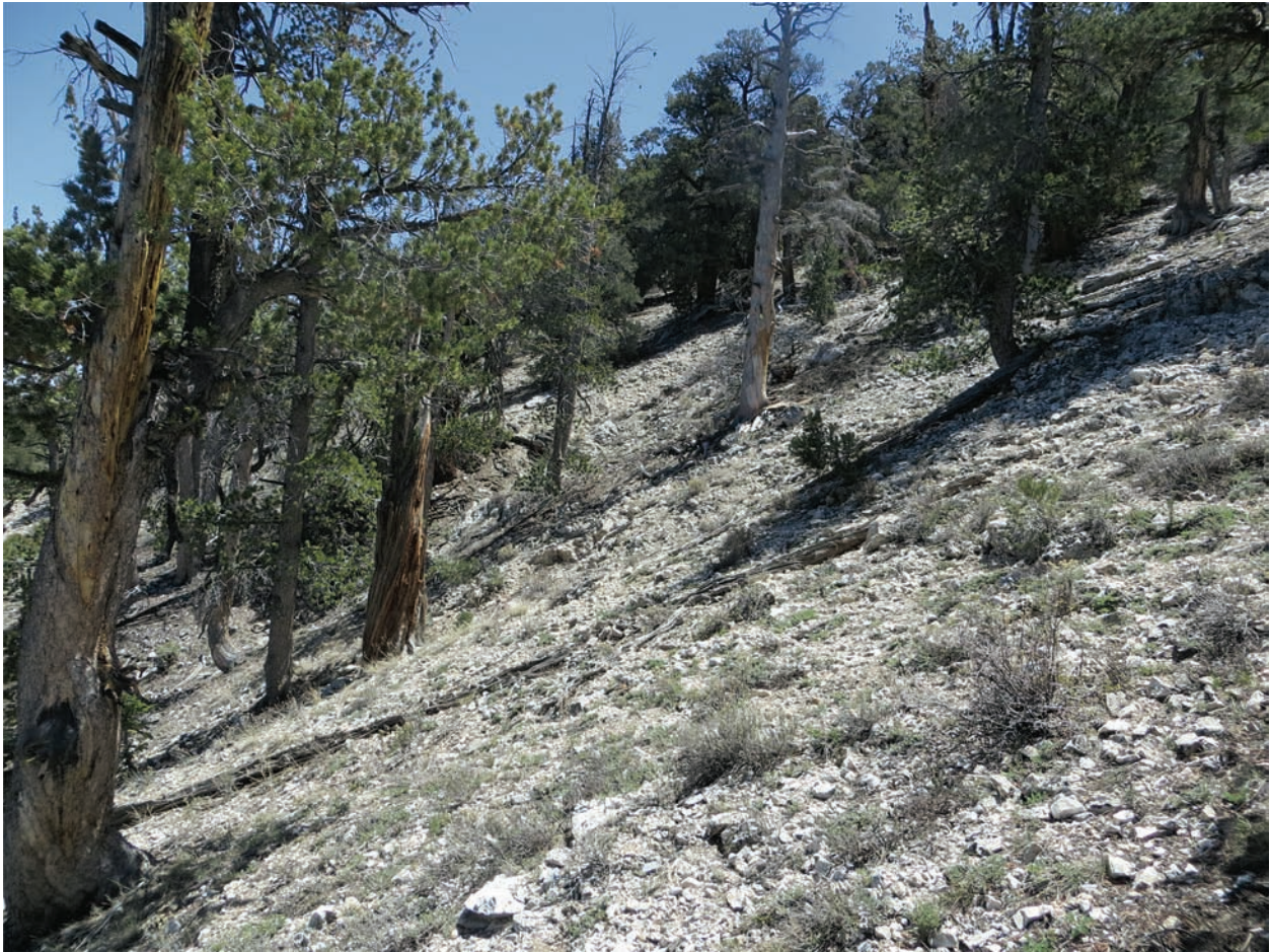
Fig. 3. Habitat of Claytonia lanceolata . Photo taken on the north slope of Bertha Ridge in the San Bernardino Mountains, southern California, near the initial discovery site of C. lanceolata var. peirsonii . White dolomite rocks characterize the landscape that is dominated by open woodland of both Pinus flexilis and P. monophylla , along with Juniperus grandis . Plants occur in dense populations on these steep hillsides underneath the shade of trees in heavy duff as well as in open sun amongst rocks.

1995; Soza and Boyd 2000; CPC 2010; CNPS 2013) suggest that C. lanceolata var. peirsonii is typically found blooming next to melting patches of snow on north-facing slopes, often in open sun amongst rocks (Fig. 3) or in shady areas with dense conifer litter (not pictured). At a more inclusive level, this taxon is described as occurring on unstable talus below ridgelines in lodgepole forest or upper montane, mixed coniferous forest habitats. Claytonia lanceolata var. peirsonii is on CNPS list 3.1, which means “needs review, but seriously endangered in California” (CNPS 2013). The purpose of this manuscript is to provide a review of the literature and draw together observations made in the field and from herbarium specimens so a more appropriate conservation status can be formulated for populations in southern California that meet the description of C. lanceolata var. peirsonii .