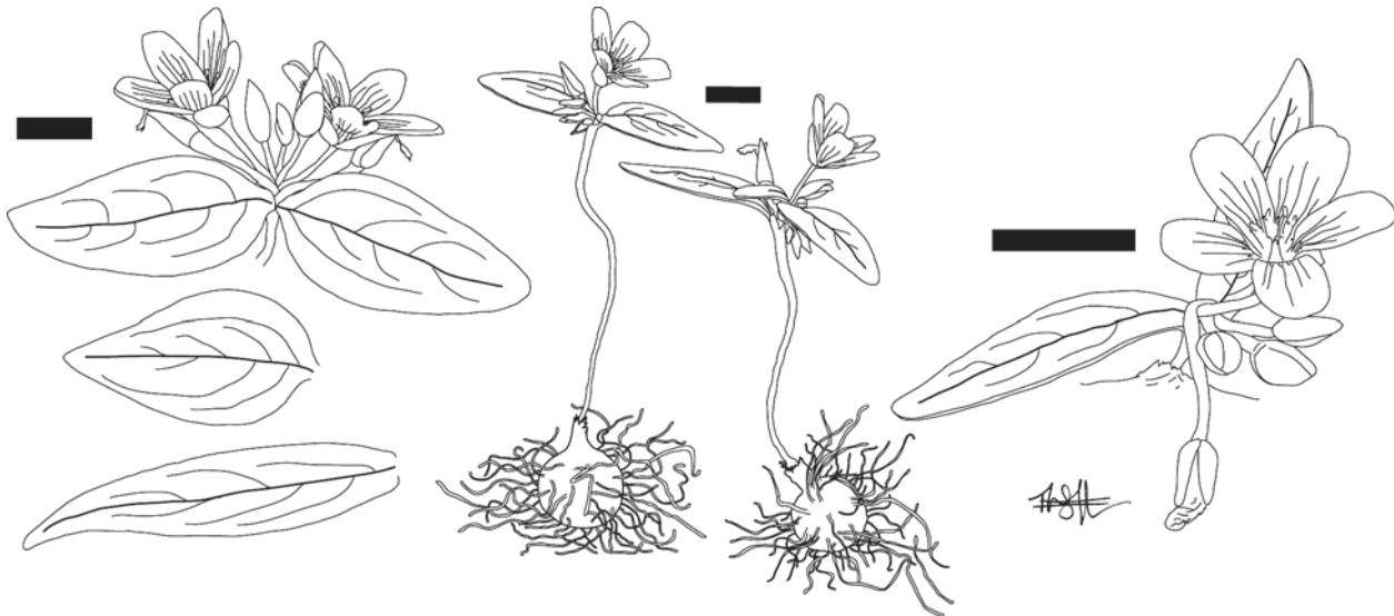
Fig. 10. Line drawing of Claytonia lanceolata var. peirsonii . Note the short above-ground stem, and variation in leaf shape. The variety differs from many members of the C. lanceolata complex by having entire (as opposed to notched) petals, but in common with other members its flowers have pink veins and yellow spots at the base of the petals. Generally, plants in the San Bernardino Mountains have narrower leaves than those in the San Gabriel Mountains from which the variety was originally described. All scale bars = 1 cm. Line drawing by first author.

Given the various issues in taxonomic research more broadly discussed by Venu (2002), we think that some subtle, yet informative, taxonomic characters exist for the southern populations of C. lanceolata that may be obscured during the process of making herbarium specimens. Aside from the ecological setting, the majority of characters most readily used to distinguish this species are undoubtedly best observed in the field, including inflorescence architecture, floral morphology, and cauline leaf shape.