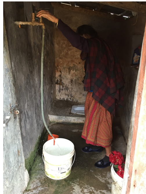
Figure 25: Typical contemporary toilet, Simigaau (Moore, Emily. Electricity house. Toilet. N.p., 2016.)

As I caught a glimpse into these tasks and many more, I became curious if the “wastes” involved actually included fecal waste at all. The inquiries I had made about “ mancheeko desa pisa ” 121 fell relatively flat, with most responses indicating a general lack of knowledge. Though my didi and group of around ten other villagers spent an entire day traveling down to Chetchet and back to porter new “ toiletko chizbiz ,” 122 when I asked more specifically about where human waste goes she waved limply towards other daadaas , “ aarko taau jaane .” 123 While I resorted to relieving myself in the jungle on many days at my baa ’s home or during afternoons working maathi , most of Simigaau’s homes and goThs now have toilets. Though “ pahilo pahilo manchee ” 124 went to the bathroom in the jungle, as well as intentionally on potato fields for fertilizing purposes, toilets, while expensive and heavy to carry up to the village, are commonly used among people in Simigaau. While my didi had explicit answers as to where human desa 125 and pisa 126 went prior to outhouses, the arrival of toilets has exported an understanding and usage of fecal matter to some nameless “ aarko taau .” 127