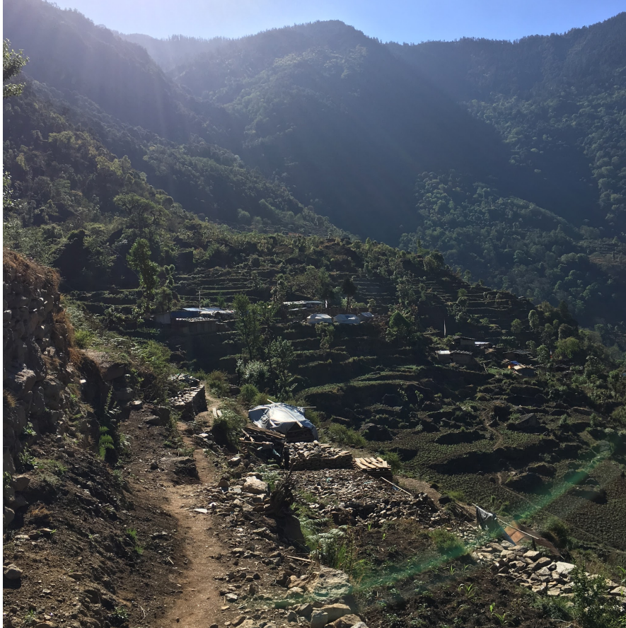
Figure 17: Simigaau hillside as seen from the jungle (Moore, Emily. Simigaau hillside. Digital image. N.p., 2016.)