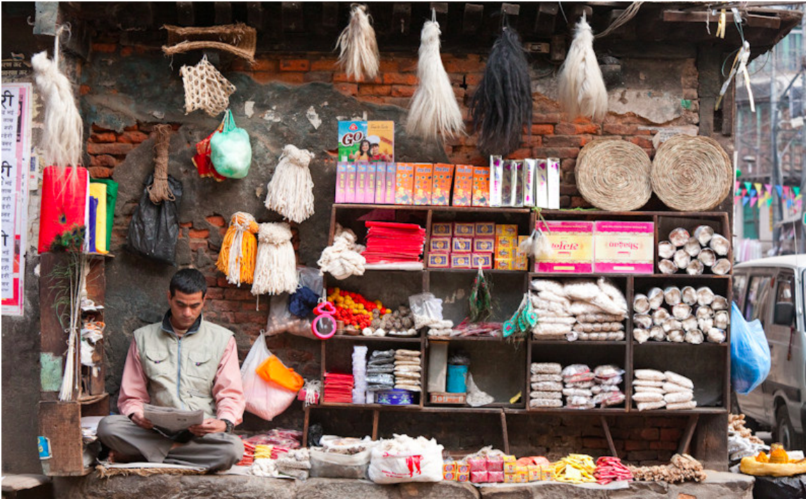
Figure 21: Typical market stand in Kathmandu

clearly resurrected through the dip in the middle of chakati , worn down by many moments I could see fluttering through her memory.