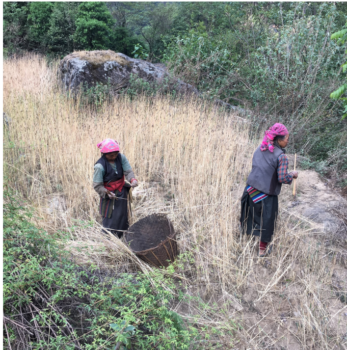
Figure 22: Women harvesting wheat, Simigaau (Moore, Emily. Wheat. Digital image. N.p., 2016.)

By my second week in Simigaau I had joined my didi , daai , baa and numerous other chimekis in all sorts of tasks, finding that regardless of the labor, nearly all these activities were interrelated. Taking cows to pasture provided mal for yummy aalu , cooked by a fire built by local people (with mal and “ khetko mato ”) 120 with firewood from the jungle carried in dokos woven with nigaalo . Cooking chhang produced feed for animals, ashes for jaDi buti , a vehicle for local trade opportunities, not to mention sustenance for long, laborious days and a means for community gathering and socializing. Harvesting wheat generates a critical food staple, but also creates material for the production of handicrafts (like chakatis ), feed for cows, and another opportunity for trade. These examples indicate the way all spheres of life depend on one another’s byproducts to sustain cycles critical to physical and cultural survival in Simigaau.