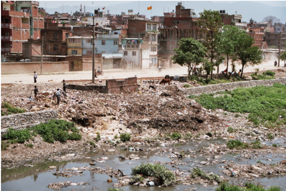
Figure 29: Non-renewables flooding Bagmati River, Kathmandu

As discussed in the brief introduction to solid waste management in the Kathmandu valley, the increase in non-renewables in Nepal is a result of a development discourse rooted in Western consumerism and materialism, as well as a result of the physical exportation of garbage by the Global North to developing countries. 151 Combined, these realities have caused a “crap crisis” of sorts, in a country with a history of “recycling” as a part of cultural tradition rather than a chore or solution to a problem. Landfills, like the Okharpauwa site touched on previously, are not the answer to municipal waste management in Nepal. 152 Aside from their technical, environmental and economic unsuitability, they misrepresent a fundamental cultural aspect found certainly in Simigaau, and seemingly in communities within the Valley as well. The