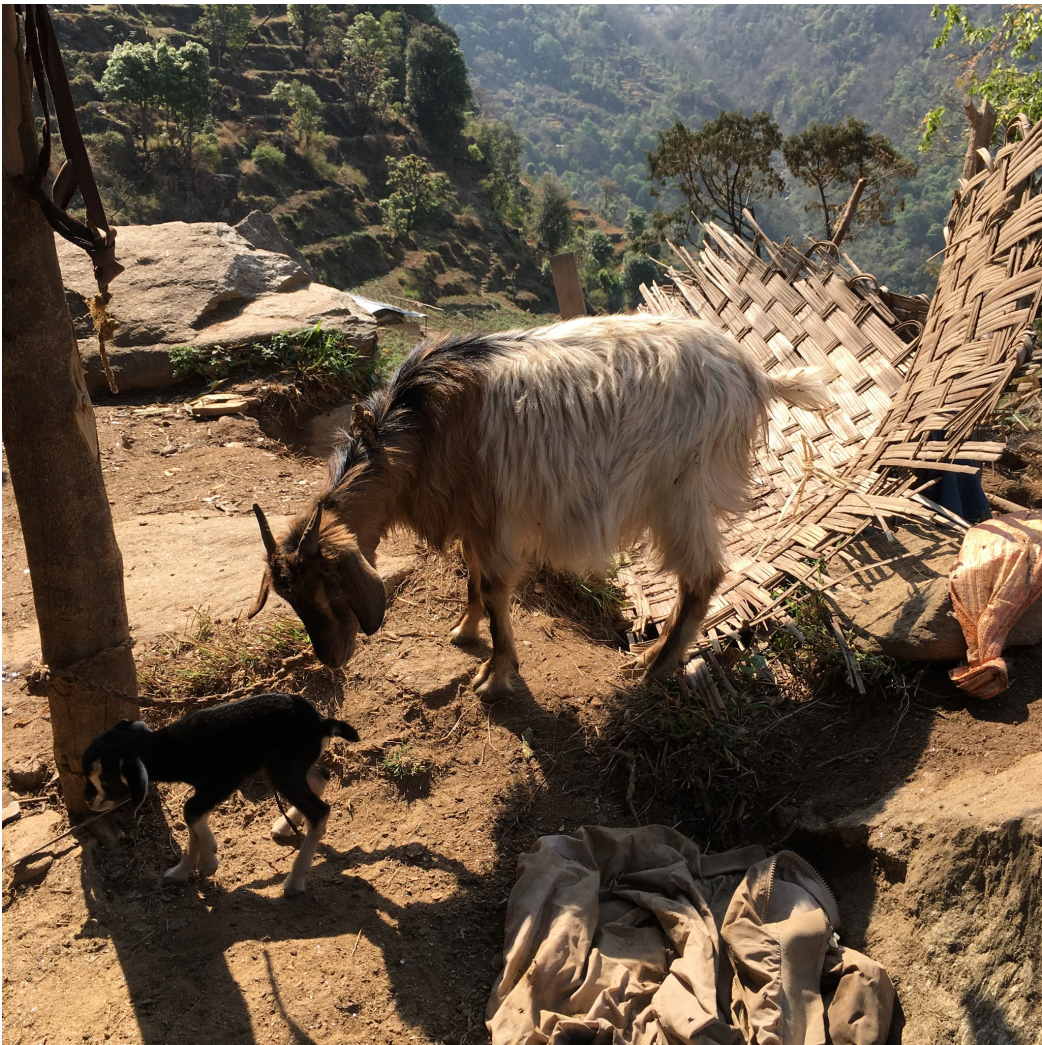
Figure 28: Goats, Simigaau (Moore, Emily. Goats. Digital image. N.p., 2016.)