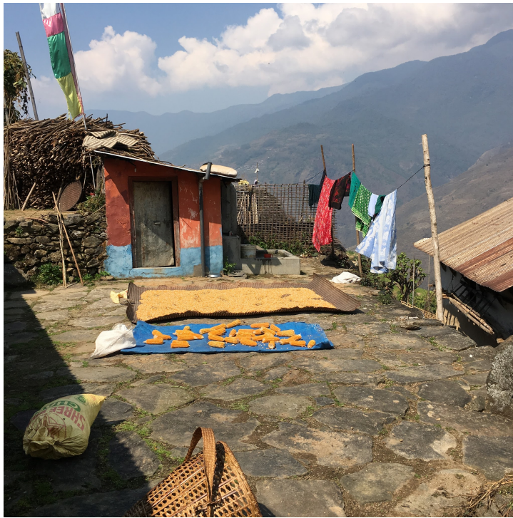
Figure 24: Chhang cooking in a family's goTh , Simigaau (Moore, Emily. Chhang. Digital image. N.p., 2016.)