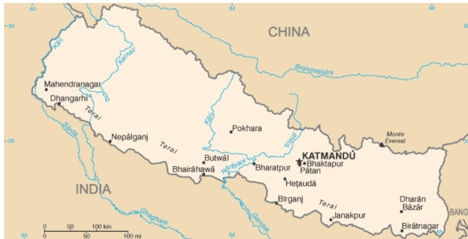
Figure 4: Location of Dolkha district in Eastern Nepal