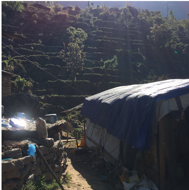
Figure 14: Didi and daai 's temporary goTh, in the wake of April 2015 earthquake, Simigaau

heading off to begin her day's task. Her work, however, is very much a part of her social space, like many women and men in Simigaau. Journeys both tala and maathi 65 were frequently interrupted by stops into chimeki 's 66 homes for a cup of chiyaa or chhang in the mornings and perhaps a bite of freshly fried Sherpa roTi 67 in the afternoons. Additionally, her work was never done alone – even days spent beside a smoky cauldron of materializing raksi were interwoven with neighborly visits and conversation.