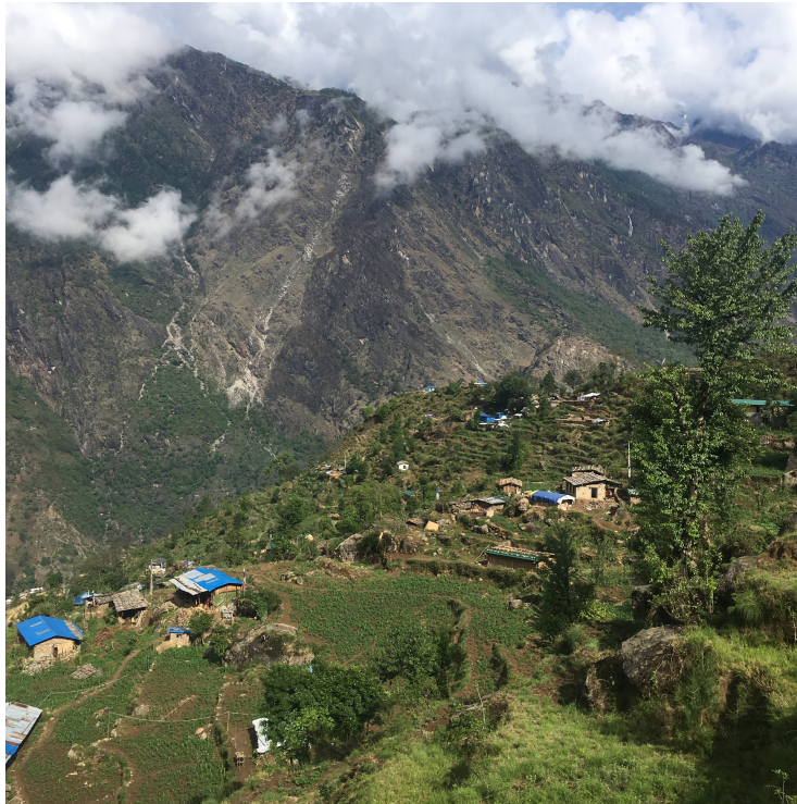
Figure 9: Clouds parting way to Gaurishankar himaals on a morning in Simigaau

The villagers of Simigaau find little rest in a typical day's routine. While the type, duration and location of work depends on the season, there are always crops to be planted, harvested or processed; fields to be prepared for new harvests or crop rotations; animals to be brought to pasture; firewood, bamboo, and grass to be cut, carried, and either fed to animals or stored; homes to be built, clothes to be washed, not to mention meals to be cooked and served with surely one or two unexpected guests who have stopped by on their way tala 40 after a long day's work. With the sunrise comes what might seem like an entire afternoon's work all to be completed before morning daal bhaat . 41 I would often start out on a morning walk to be greeted