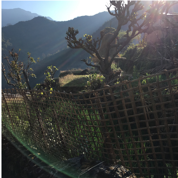
Figure 20: Chitra used to shelter and corral livestock, Simigaau (Moore, Emily. Chitra. Digital image. N.p., 2016.)