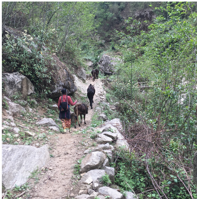
Figure 16: Dorgieaamaa herding cows into the jungle for grazing, Simigaau

I followed her a bit farther up the jangal pathway. We made our way to what seemed like the corner of the mountain – I looked out on what has become a very rungichungi 85 Simigaau with pops of orange, blue and “logo-ed” tarps marking goThs that would otherwise remain