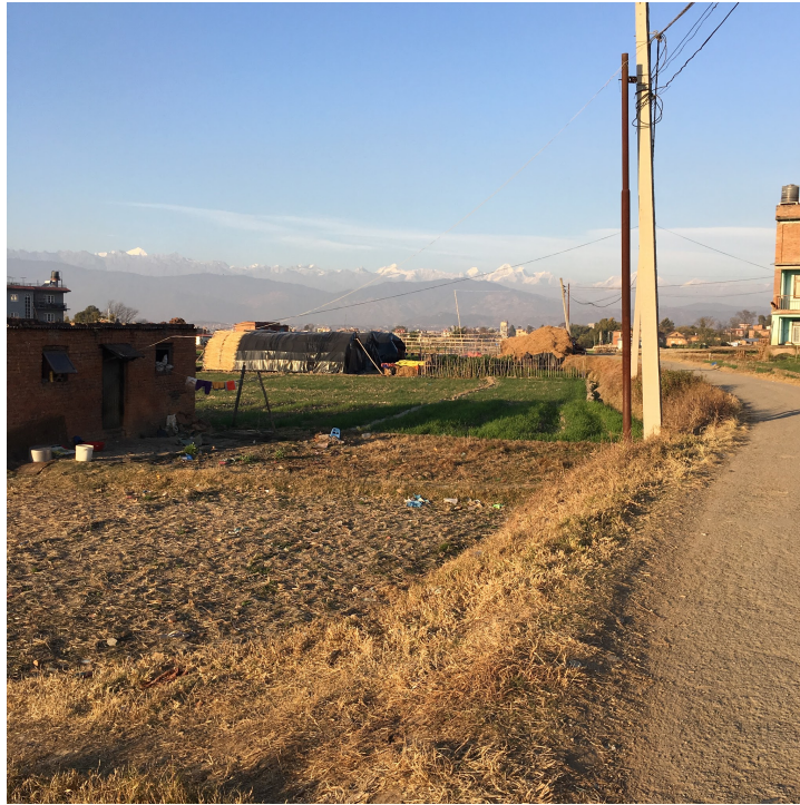
Figure 27: Wheat field, Simigaau (Moore, Emily. Simigaau wheat. Digital image. N.p., 2016.)