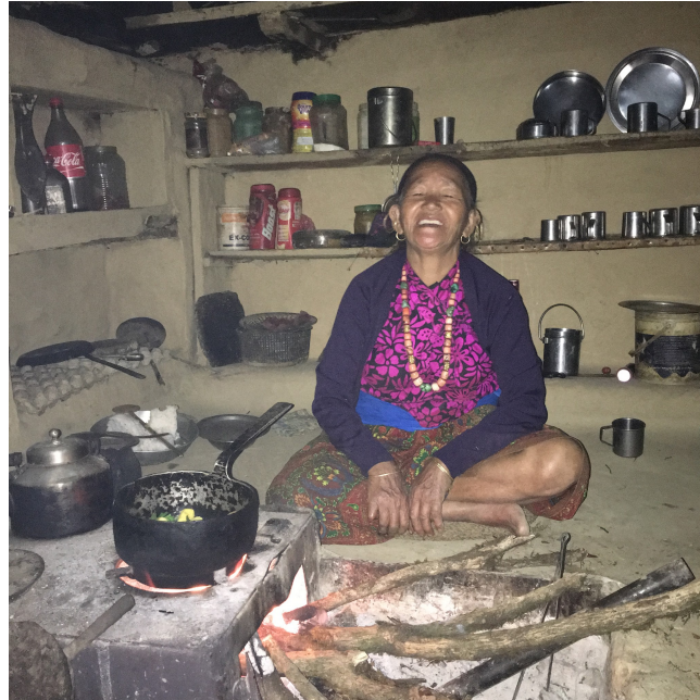
Figure 12: Tamang woman seated by the fire in her goTh preparing khajaa for visitors (Moore, Emily. Khajaa . Digital image. N.p., 2016.)

interacting with villagers and observing the way products and byproducts travel in and out of spaces, or how they continually reinvent themselves in Simigaau’s precious soils.