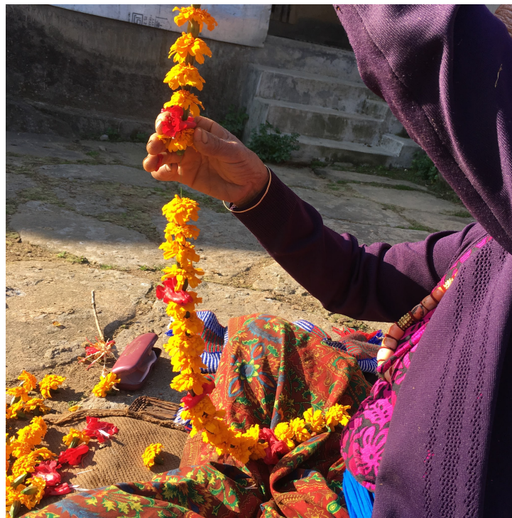
Figure 32: Tamang woman stringing mala , a flower chain made for farewell ceremonies from sacred Marigold and Rhododendron petals found in most middle hill villages throughout Nepal

As this thesis exhibits, Simigaau’s work, habits, social and physical environment, and values reinforce and rely on one another. I found that at the core of this interwoven relationships are the tangible “wastes” produced by the fields and the forests, at the “table” and after visiting the pasal , by both livestock corralled by chitras and the people of Simigaau themselves in the more modern toilets, the jungle or on the aalu khet . As facilitators of life cycles and styles in Simigaau, products and byproducts tell a story about cultural values, how they are changing and how they have survived.