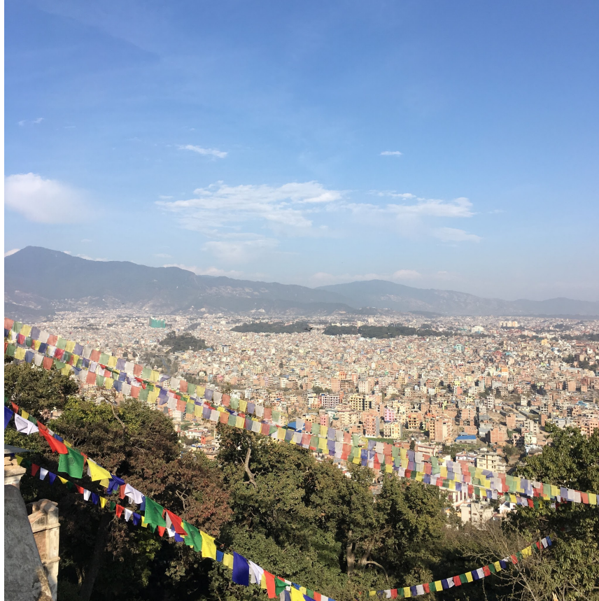
Figure 1: Kathmandu Valley as seen from Swayambhunath stupa, West of Kathmandu city.

In the spring of 2016 I had the opportunity to study abroad on a Pitzer College coordinated program in Nepal. In the six months spent in the country, I travelled to rural communities in central, eastern and western parts of the country – where Kathmandu, the capital, is also the heart not only governmental affairs, but the only option for Nepalis interested in pursuing an education or becoming involved in a life outside of subsistence agriculture and animal husbandry in their home village. Despite this fact, I found that many young people migrating out of villages and relocating to Kathmandu quickly long for their villages, for more reasons than nostalgia. The rapid pace of development taking place in Kathmandu has left the city's streets, skies and soils polluted and without the resources to manage the inundation of non-