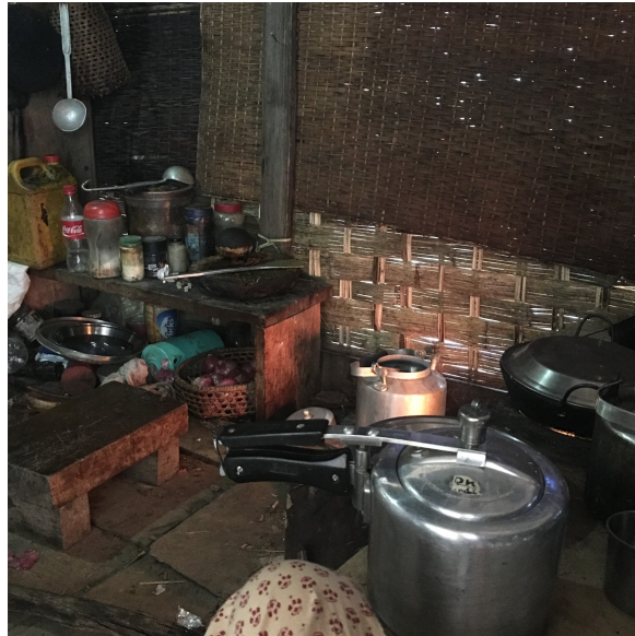
Figure 15: Within didi and daai 's goTh, Simigaau

My daai 's routines were slightly more invisible to me. Much of his time was spent maathi or tala building and repairing homes alongside other village men. Sometimes he would join my didi at her baa 's home around khajaa time, helping in the fields and providing her company while watching the cows. At least three separate times he was needed all day at the site of a pujaa , or in one case, a wedding, to lend a hand in preparing a massive bhoj 68 of massu , 69 tarkari and of course, bhaat . Though quiet, he was always especially conscious that his guests were comfortable in his home and would typically return to his goTh in the early evening to sit quietly with a cup of chhang and smile in the shared company of family and friends. While my didi spoke to some of his past jobs portering for trekkers and spending a small window of time in Kathmandu during my didi 's first pregnancy, she noted his strong preference for Simigaau. Isolated from his cherished community in the village, my daai hoped to leave Kathmandu as