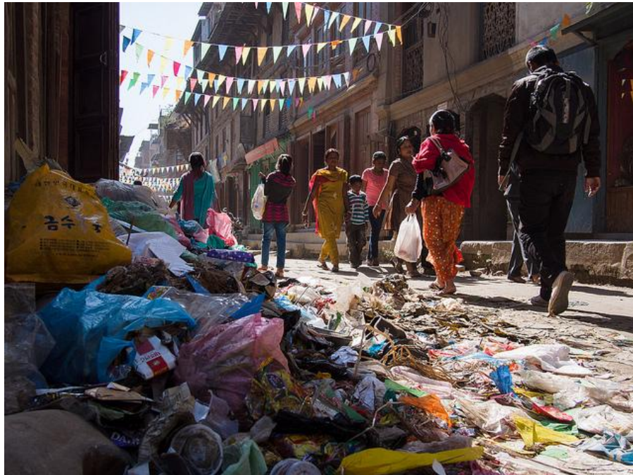
Figure 13: Assorted plastics in Kathmandu's streets