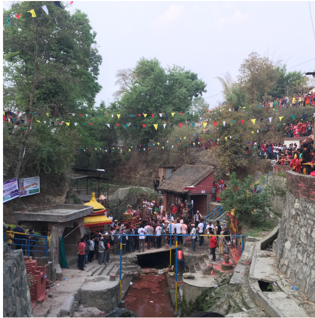
Figure 7: Mill, Simigaau (Moore, Emily. Mill . Digital image. N.p., 2016.)