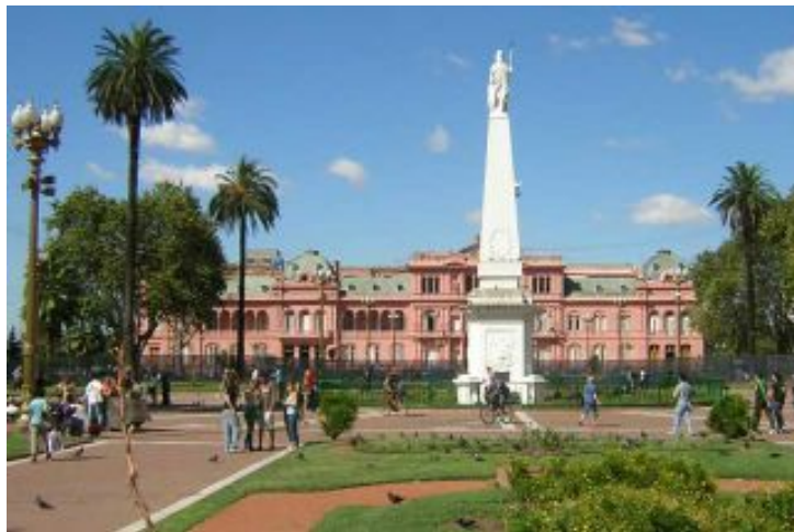
Image 5. The Casa Rosada, home of the Executive Branch of government in Argentina and the May Pyramid, the object the Mothers initially circled in a counterclockwise fashion in defiance of the violent, unjust Junta.