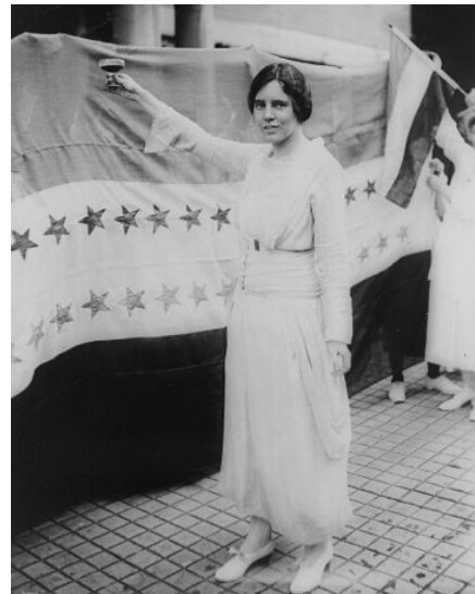
Image 11. Alice Paul toasts to the passage of the nineteenth Constitutional amendment with a valiant salute to the suffrage flag outside NWP Headquarters.