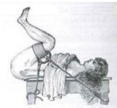
Image 4. A drawing of the medical examination performed by the British Government on women suspected of prostitution under the Contagious Diseases Acts.

According to London College archives, the Commission wrote candidly to the reviewing Royal body, using Butler's rhetoric against her, explaining, "The absence of public solicitation [for prostitution] is a material gain to public decency and morality. It is hardly disputed that a sensible improvement has been observed in the streets in the conduct and demeanour of the women since the Acts came into operation. Soldiers and sailors under the influence of drink are no longer importuned and seized upon by filthy prostitutes as they were in former days." 68 While the Lords re-assert their firm belief of the instigation of prostitution by women only, they do address the counter-argument that