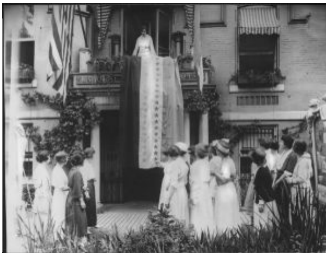
Image 7. Paul stands in the balcony of NWP headquarters, hanging the purple, white, and yellow suffrage flag visible and in plain view of windows on the north side of the White House.

Two months before Wilson's second inauguration, Paul again planned to attract both Wilson's attention and that of the nation. On January 11, 1917, Paul and other NWP members walked across the street from their headquarters to the north gates of the White