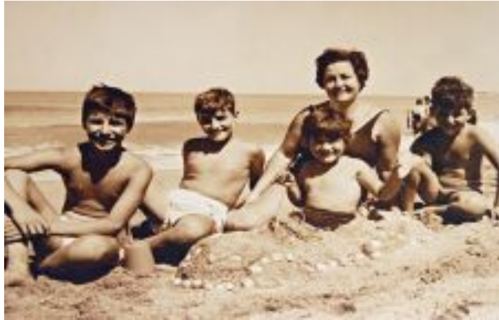
Image 6. Azucena Villaflor with her four sons.

Buenos Aires, La Nacion and La Prensa , to pay to advertise the unjust government abductions.