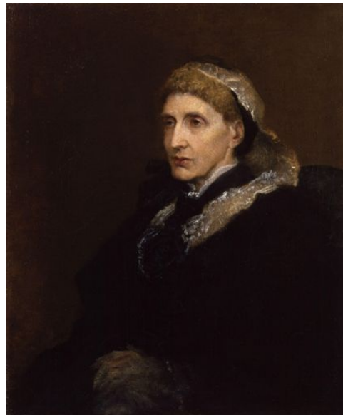
Image 5. An oil painting of Josephine Butler created by George Frederic Watts in 1894.

repeal of the Acts. The article does not call her moral question the government regulation of prostitution. Boyd argues the Times failed to address the question because, even after Butler's campaign, "Prostitutes represented not the 'worthy' poor for whom British society had found a place, but those who had been rejected." 85 Prostitution, however, was merely an economic symptom of a greater gender-biased problem facing Great Britain. As Butler identified, British society could not rightfully reject poverty as a social crime when few options, outside of prostitution, were available to women as paid work. Butler not only fostered the repeal of the Contagious Diseases Acts, but also drew attention to a greater plague in British Victorian Society: the inevitability of poverty for women, outside circumstances of their control. Before a government funded system of social safety nets, Butler was a pioneer in bringing about a consciousness and empathy for such women. The impact of her activism in validating the rights of women to their bodies aided wider developments to improve the standing of women in British society.