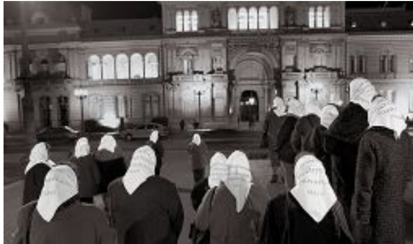
Image 8. Mothers of the Plaza de Mayo still wait outside the Casa Rosada in the Plaza de Mayo, wanting information from the Argentine government on the location of their children.

fixed on the future. Unless we learn to forget we will be turned into a pillar of salt.” 75 For Villaflor’s family, however, it is impossible to forget; their innocent mother was brutally tortured and killed as a result of the past. No justice was served.