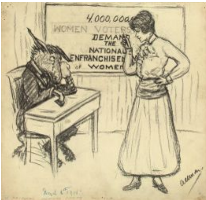
Image 6. One of Allender’s cartoons from 1915, after Paul gathered four million signatures supporting women’s suffrage in a nationwide auto-caravan.

Paul’s advocacy progressively exceeded in creativity and severity as Wilson refused to acknowledge that national sentiment was changing in favor of women’s suffrage—mostly as a result of Paul’s leadership of a nationwide movement. At the 1916 State of the Union address, at the exact moment as Wilson called for democracy