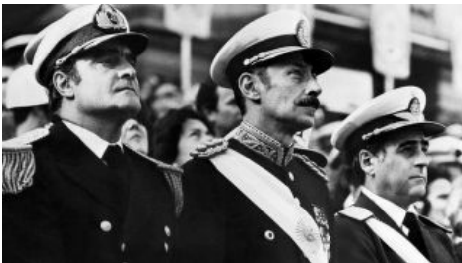
Image 1. The three leaders of the Junta military dictatorship: Admiral Emilio Massera (Argentine Navy), General Jorge Rafael Videla (Argentine Army), and General Orlando Ramon Agosti (Argentine Air Force).