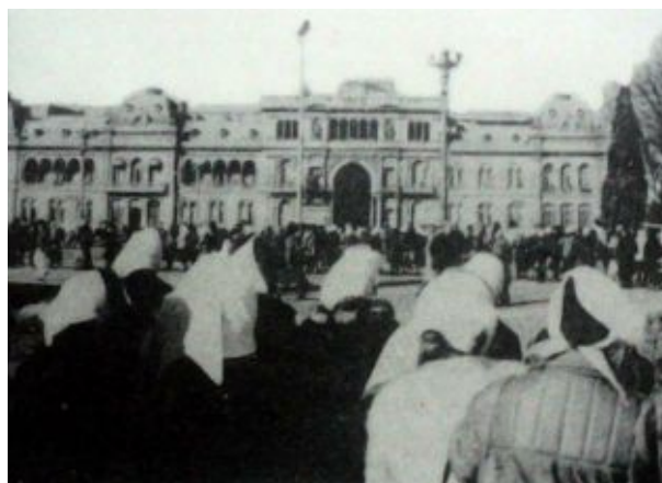
Image 3. A group of mothers gather outside the Casa Rosada in the Plaza de Mayo in late 1977.