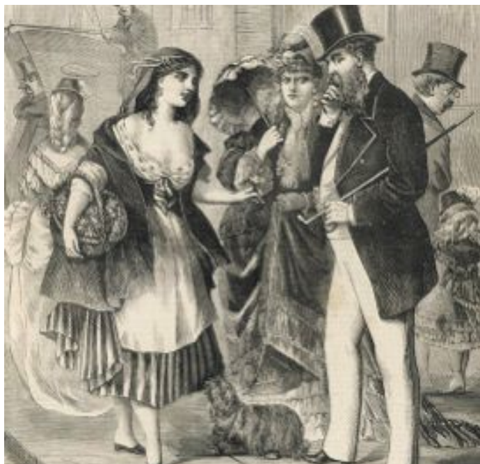
Image 2. A drawing of a poor girl attempting to prostitute herself at a market. In 1875, the age of consent in Victorian Britain increased from 12 to 13 years old. While the age was increased a decade later, it remains 16 years old in Great Britain.

After recognizing the dire circumstances faced by women straddling the gap between poverty and prostitution, Butler decided to act to create a space of refuge for such women. In 1866, Butler initially opened her own home, and subsequently opened a separate, independent space, called the Home of Rest. Butler sought and received funding