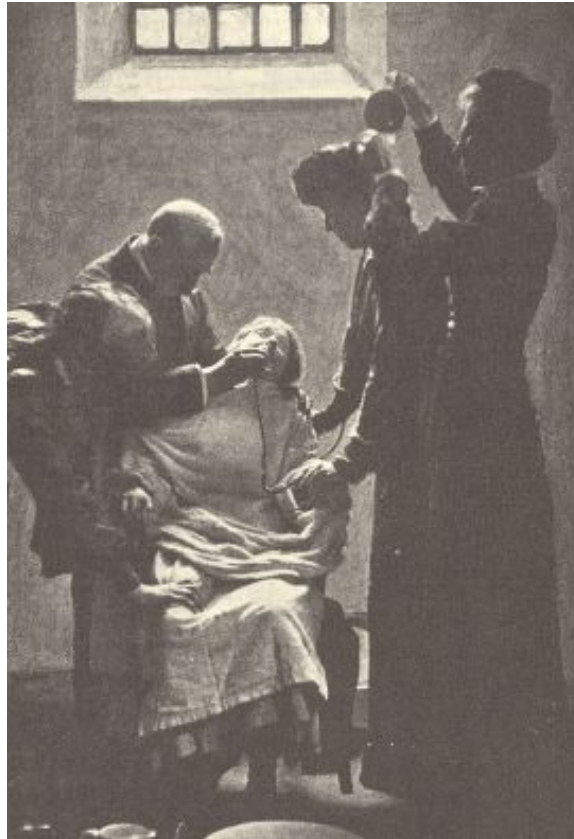
Image 1. An unidentified suffragette is forcibly fed with a tube entering her nasal cavity reaching through her esophagus, and down to the stomach in Holloway Prison in Great Britain. Undigested liquid was poured directly down to the stomach through the tube (1911).

“Although palpably ill, Miss Paul was cheerful, telling me she did not regret her conduct, and was prepared to repeat it again if necessary.” 20