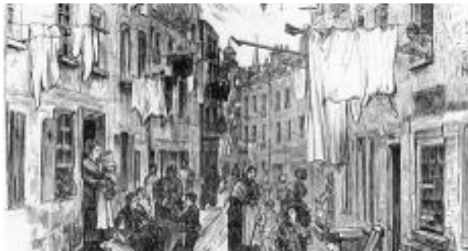
Image 3. A neighborhood of the “daughters of the poor” in London, where women who were unmarried or widowed vastly outnumbered the number of men in the area.

Butler quickly realized the police played a central role in this unjust policy. Butler wrote of her observations in Dover, “The honest working girl was subjected to a permanent threat of blackmail—it required only one information laid at a police station,