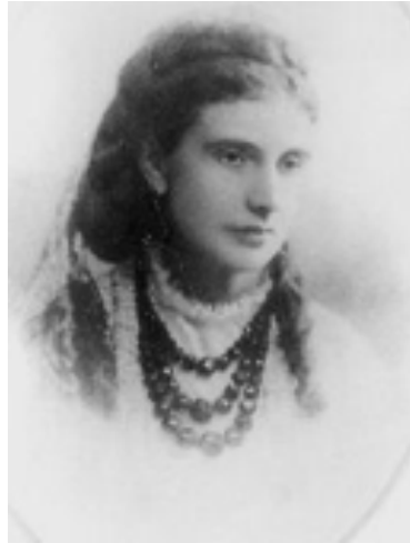
Image 1. A young Josephine Butler shortly after her marriage to George Butler in 1852.

gentleman and farmer, educated and uneducated.” 26 Yet given her exposure to an environment of equality in her youth, Butler was aware of the sufferings of others. Boyd describes Butler’s inner-struggle to rationalize her life of privilege. While Butler was,