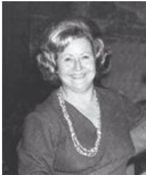
Image 2. Azucena Villaflor shortly before her forced disappearance in December of 1977.

both initially enjoyed the comforts of routine and structure, Villaflor was forced outside of her previously enjoyed lifestyle after her son’s kidnapping. For the first time, she began to witness the existing ills of society with the heightened consciousness of a political outsider.