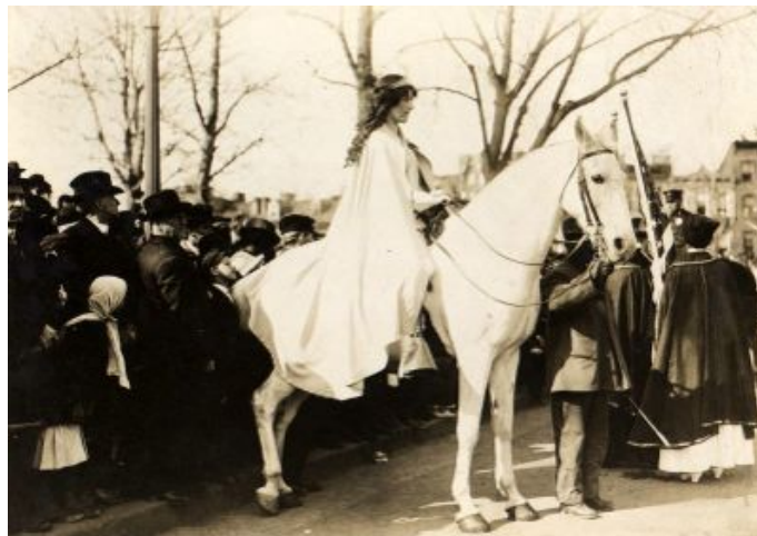
Image 4. Inez Milholland leading the parade on a white horse, despite male bystanders blocking the path of the parade.