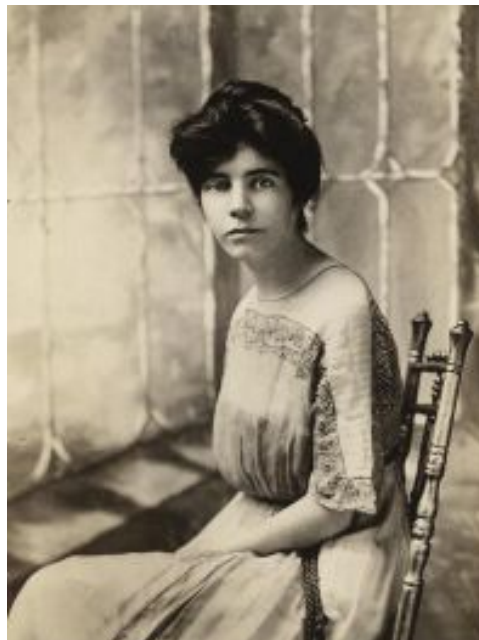
Image 5. Alice Paul shortly after her return to the United States.

In her second bold action, using her delicate appearance, Paul scheduled a meeting with President Wilson shortly after his inauguration. The political journalist David Lawrence credits Wilson openly believed women interested in suffrage were