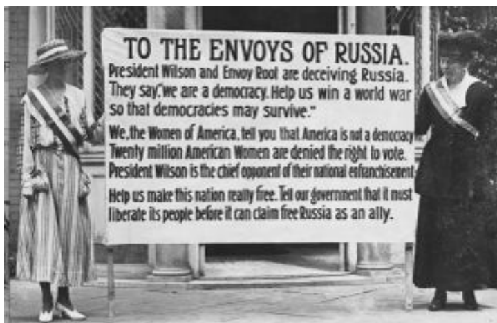
Image 9. The duplicate banner, shortly before it was ripped down.