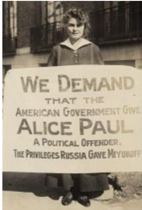
Image 10. A member of the NWP stands outside jail requesting that Alice Paul be released.

women. I know she has bitterly opposed the Democratic Party, but I cannot believe that the President or the men he has appointed will deliberately risk her life in this way.” 63