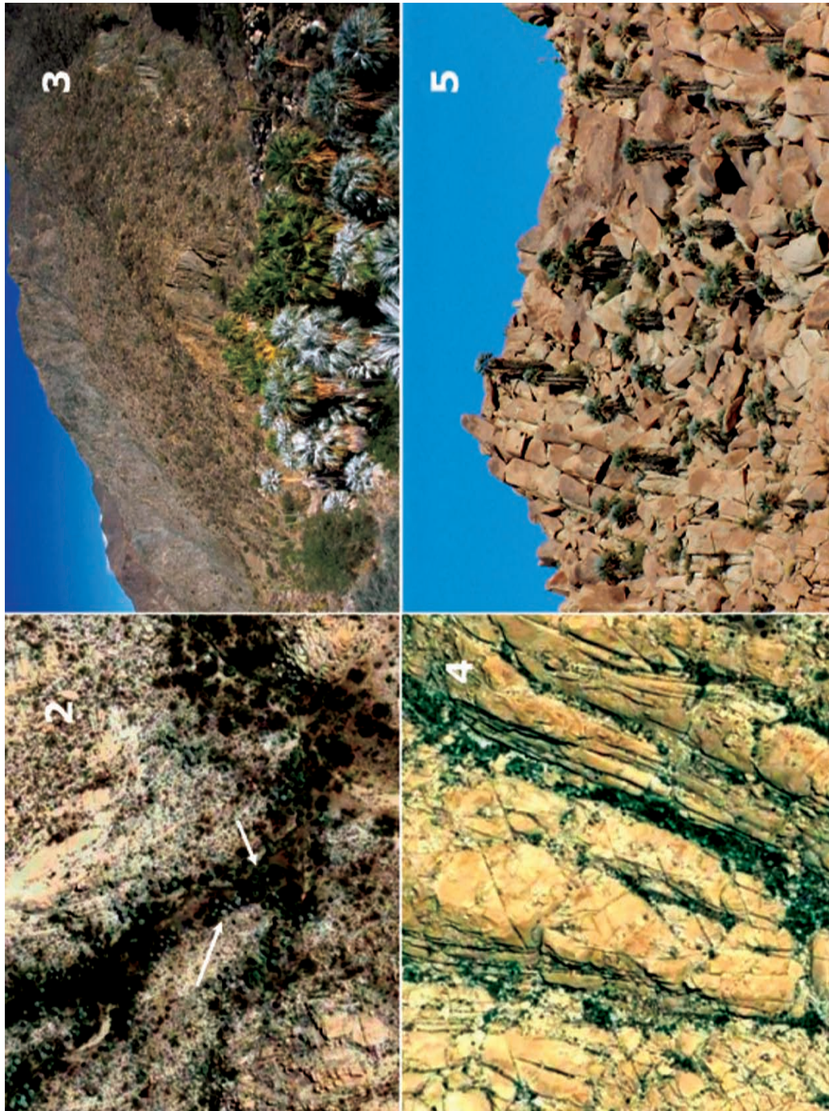
Fig. 2-5. Fan palm oases in the Baja California peninsula (Mexico).—2. Google Earth image of Washingtonia robusta (dark green, short arrow) along a moist watercourse and Brahea armata (bluish-gray, long arrow) on drier slopes above on a resistant granitic formation in the southeastern Sierra La Asamblea.—3. Oasis of Washingtonia robusta (green) and Brahea armata (grayish-blue) along a watercourse on the west slope of the Sierra La Asamblea.—4. Google Earth image of dwarf Brahea armata on resistant granitic bedrock slopes at Cataviña.—5. Dwarf Brahea armata on granitic bedrock slopes in the Arroyo El Berrendo watershed, southern Sierra San Pedro Mártir.