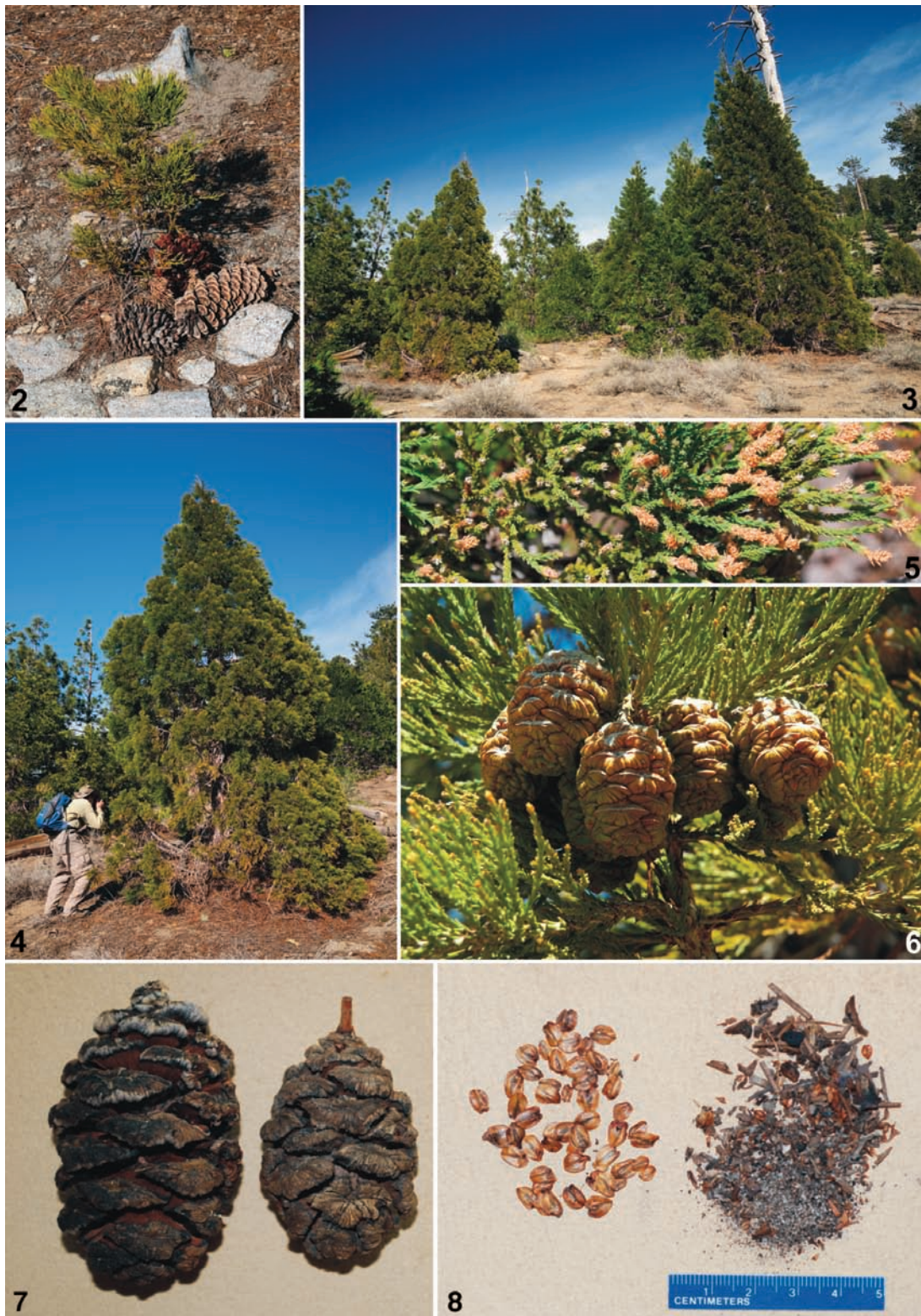
Fig. 2–8. Sequoiadendron giganteum .—2–6. Naturalized on Black Mountain (summit el. 2369 m), northwestern San Jacinto Mountains, Riverside Co., California.—2. Outlier sapling (#49) at 2361 m el.—3. Trees up to ca. 30 years old and ca. 5.5–6 m tall at the sloping plateau or saddle at 2144 m el.; tree (#28) left of center enlarged in Fig. 4, 6. Note the classic conical or pyramidal form of these uncrowded trees.—4, 6. Tree (#28) ca. 5.5 m tall, with Rudolf Schmid and male and female cones.—5. Male cones from tree (#c1) at 2066.5 m el.—Fig. 7–8. Items collected 1 May 2009 from the ground on Black Mountain at ca. 2070 m el.—7. Mature seed cones (70, 57 mm long).—8. Winged seeds (50) retrieved from 8 seed cones; mix of sandy granitic soil and sparse duff with needles ( Abies concolor ) and shoot segments ( Calocedrus decurrens ). Photos taken 1 May 2009 (Fig. 2–5), 3 May 2008 (Fig. 6), 31 Jan 2010 (Fig. 7), and 16 Apr 2010 (Fig. 8).