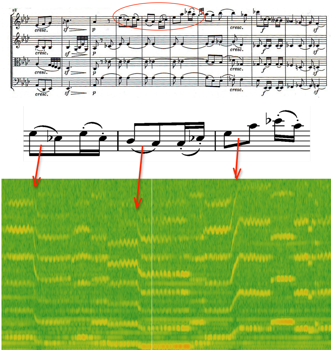
Figure 1. Beethoven, String Quartet op. 74, movement 2, mm. 24–27.

A new approach to performance was emerging in the era of the gramophone, which took effect particularly clearly in the realm of Beethoven quartet performance. The approach can be understood as a consciously heightened persuasive and “explanatory”