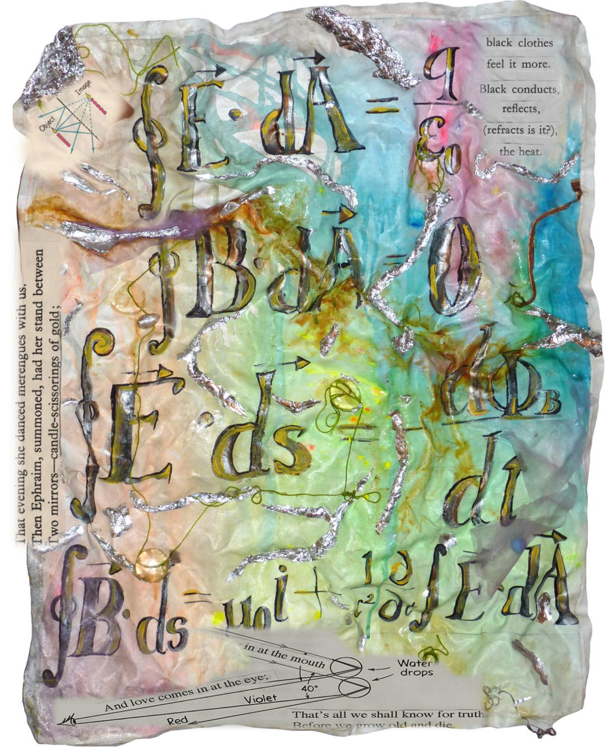
The STEAM Journal, Volume 1, Issue 1 'Luminare' 3/13/13