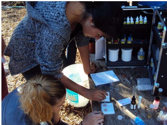
Students in the independent study course test nitrate content of soil and compost samples in a hands-on activity.

To make the curriculum place-based, I took advantage of local resources as much as possible in each exercise and included readings from previous scholarly work done at the Farm. For example, I used amaranth and tomatoes, two crops commonly grown at the Farm, to illustrate two different kinds of photosynthesis, and two reading assignments were final projects written by students in “Food, Land, and the Environment” about irrigation and bees