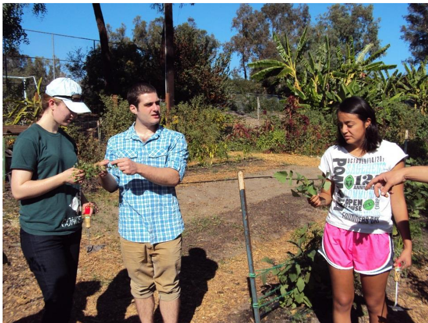
Students identify common weeds during the first week of the Weed Lab, an exercise that could be improved in future years.

Students also provided astute feedback on how to improve specific exercises, particularly the Weed Lab and Soil and Compost Chemistry Lab. For the Weed Lab, in which we identified common weeds and compared how quickly they returned after hand weeding, students suggested adding “a class discussion about what our collective conclusion was” and “more identification of a