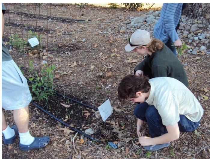
Students prepare to maintain the group plots during the independent study course in fall 2013.

The final subset of topics was chosen in part based on the results of the fall 2013 survey, in which students were asked to select all topics they would be interested in studying. 196 The course culminates in an independent final project on a topic of one’s own choosing, so that students