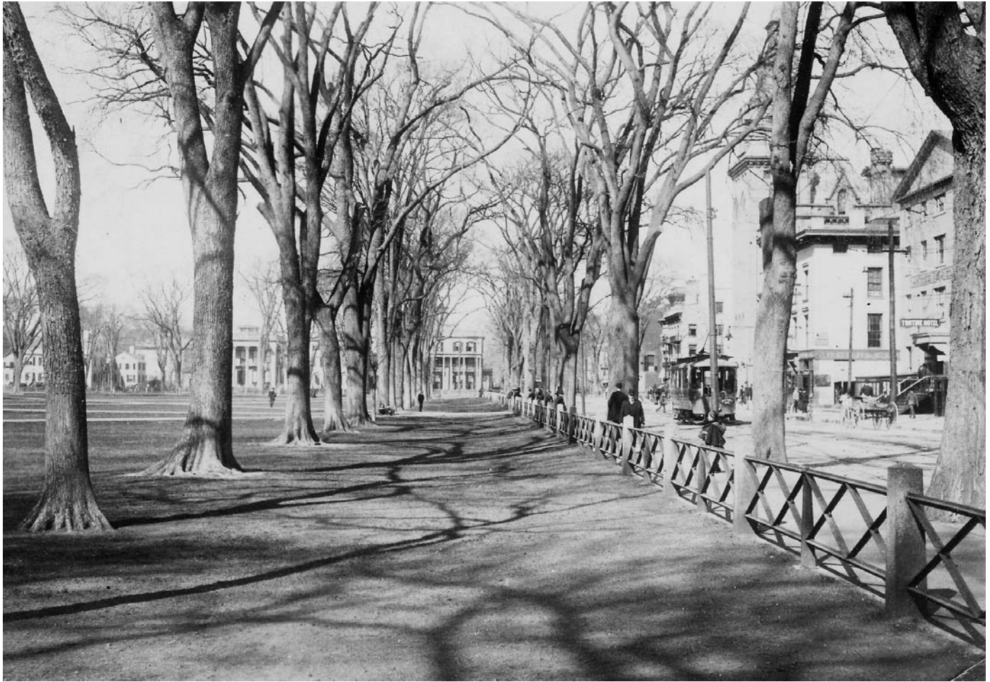
New Haven, Connecticut, at the turn of the last century. The city was one of many that embraced tree planting on a large scale and took to calling itself “Elm City.”

was as a popularizer of Marsh’s compelling ethic. 2