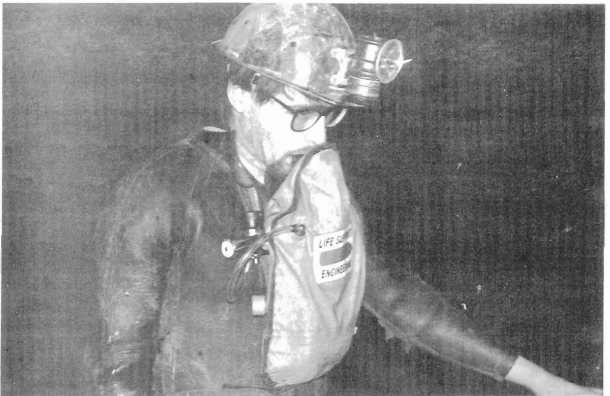
Prototype oxygen re-breather apparatus in use in Bridge Cave, South Wales.