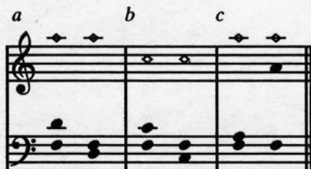
Figure 2. Some comparisons for testing the purity of an octave. (The two intervals within each comparison should beat equally fast.)

fast as the lower one; and so on. In any temperament (regular or irregular), each tempered interval should beat twice as fast as its duplicate an octave lower—and each note should beat the same with the notes a major 6th above and minor 3rd below (see Figure 2a), with those a 5th above and 4th below (see Figure 2b), and with those a major 3rd and major 10th above (see Figure 2c): this rule can be helpful in refining the purity of the octaves.