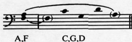
Figure 4. First steps in setting a meantone temperament.

Now tune C , G , and D to make the chain of 5ths and 4ths F-C-G-D-A as shown in Figure 4. Make A-D beat twice per second for 1/6-comma meantone, or slightly less than three times per second for 1/4-comma meantone. In any case, make G-C beat half again as fast as C-F , and A-D half again as fast as G-D . (Meet these requirements by adjusting C , D , and G while leaving F and A alone.)