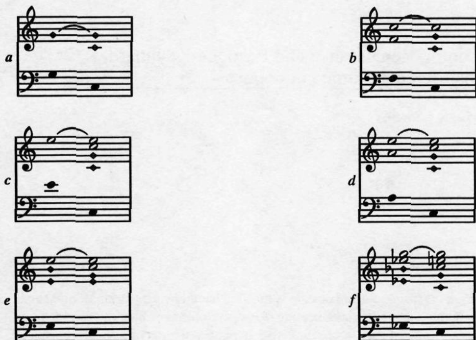
Figure 1. Unisons between overtones in consonant intervals.

In each case, if the timbre is harmonic (which it is on the organ, and nearly so on the harpsichord and in the middle octaves of a piano), then if the unison between overtones as shown in Figure 1 is pure, the interval as a whole will be pure, and if that unison is not pure, its rate of beating will show how much the interval has been tempered—except that one other factor must be taken into account: the approximate pitch-frequency of the unison itself. For example, to temper identically two intervals of the same kind but a step apart in the scale (say, F-C and G-D , or F-A and G-B ), the interval a step below should be made to beat just barely slower (about 10 % slower) than the one a step above. This principle is basic to setting any regular temperament: if two equivalent intervals are a 5th apart—for instance C-E and G-B a 5th higher—the higher one should beat half again as fast as the lower one (because the ratio for the 5th between the unisons among the overtones is approximately 3:2); but if they are a 4th apart—for instance C-E and F-A a 4th higher—the higher one should beat 1/3 again as