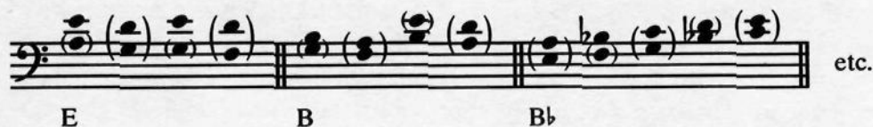
Figure 5. Next steps in setting a meantone temperament.

Figure 5 suggests how, in expanding the temperament to include additional pitch classes, each new one should be tuned to form intervals which beat just slightly slower or faster than any equivalent intervals a step above or below that have already been tuned. Figure 6 shows the final result (and includes some beat rates for 1/4- and 1/6-comma meantone, the corresponding rates for 1/5-comma meantone being intermediate to these).