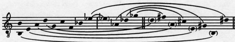
Figure 3. A procedure for setting a quasi-Pythagorean temperament.

Tune pure all the intervals shown in Figure 3. Start with a pure octave between middle B and tenor's low B ; then tune pure a chain of eight 5ths and 4ths as shown ( B-E-A-D-G-C-F-B b -E b ), while taking care to make none of the 5ths larger than pure, nor any of the 4ths smaller. Upon reaching E b check to see if it makes a pure major 10th with the initial low B (see the end of Figure 3), and if not, review the chain B-E-A-D-G-C-F-B b -E b and take more care to assure that none of the 5ths are larger, nor 4ths smaller than pure. Then tune A b /G # pure with E b , E , and B ; then D b /C # pure with A b , A , and E ; and finally G b /F # pure with D b , D , and A .