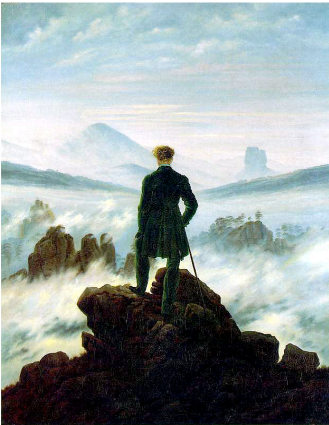
Caspar David Friedrich, Wanderer Above a Sea of Mist, c.1818