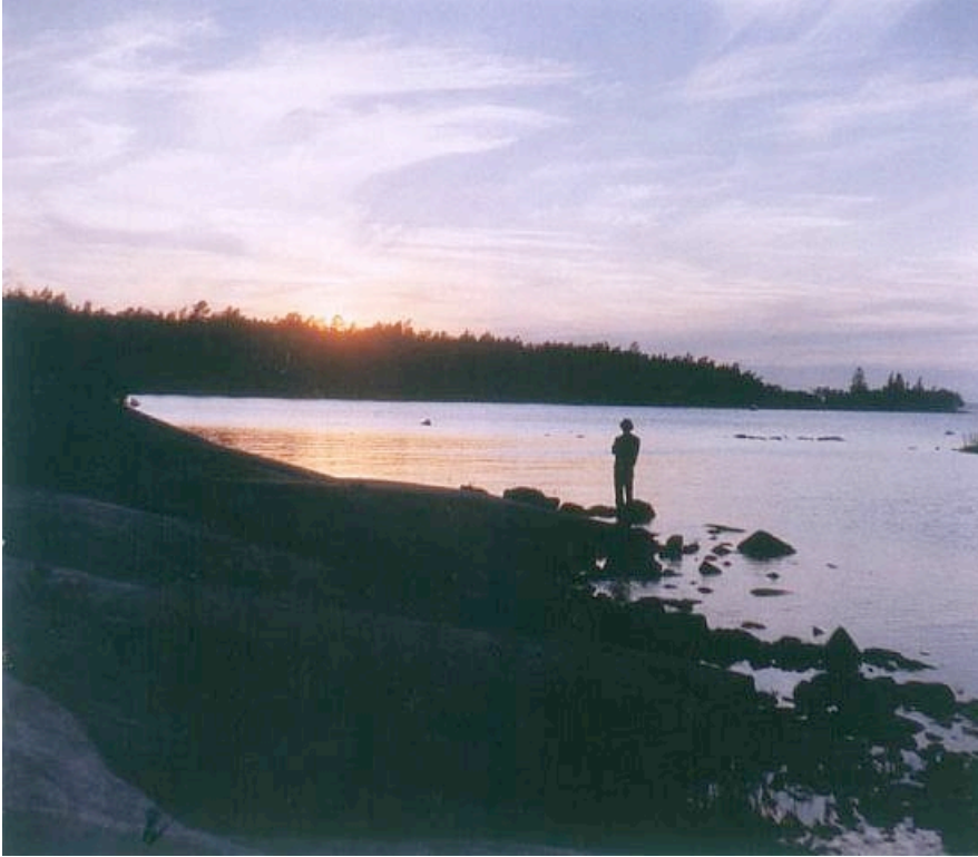
Bas Jan Ader, Farewell to Faraway Friends, 1971