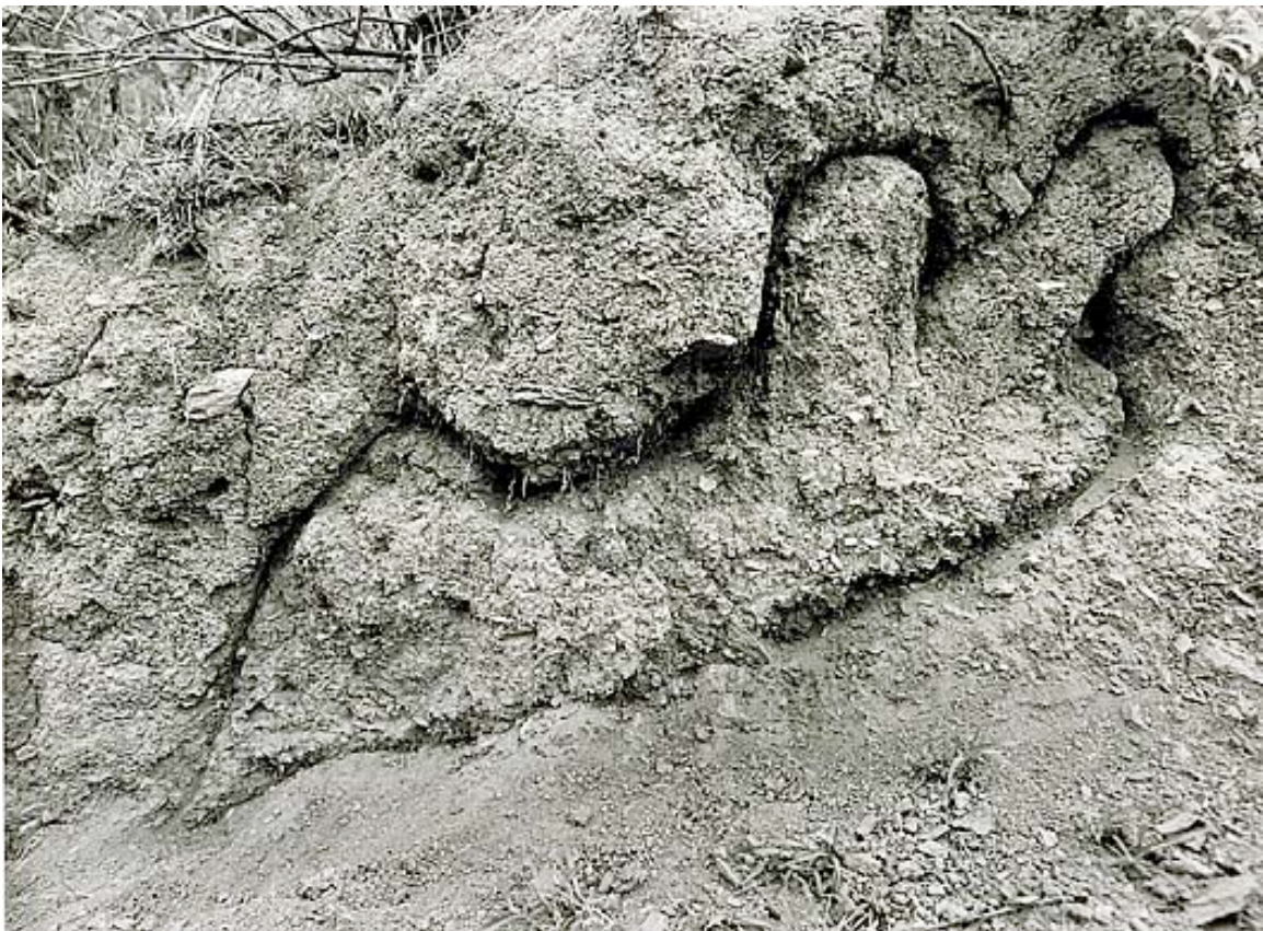
Ana Mendieta, Untitled , from the Silueta Series , 1980, Smithsonian American Art Museum

As her practice evolved aesthetically, it also did so ideologically and referentially. The silhouettes in the Silueta Series moved away from being a reproduction of the outline of Mendieta's body, and became instead a universal archetype of woman. These goddess figures were the result of changes to Mendieta's interests and motivations. Going beyond personal healing and transformation, she turned her attention to the ability of art to transform the world around her. These later silhouettes are signs of ideas beyond the personal; they refer to Mendieta's attempt to heal the wounds of society: the separation between the modern world and nature. The photographs in Silueta Series were no longer just signs of Mendieta's struggle with her personal demons, but addressed larger issues of modern life, as well as long-standing archetypal notions.