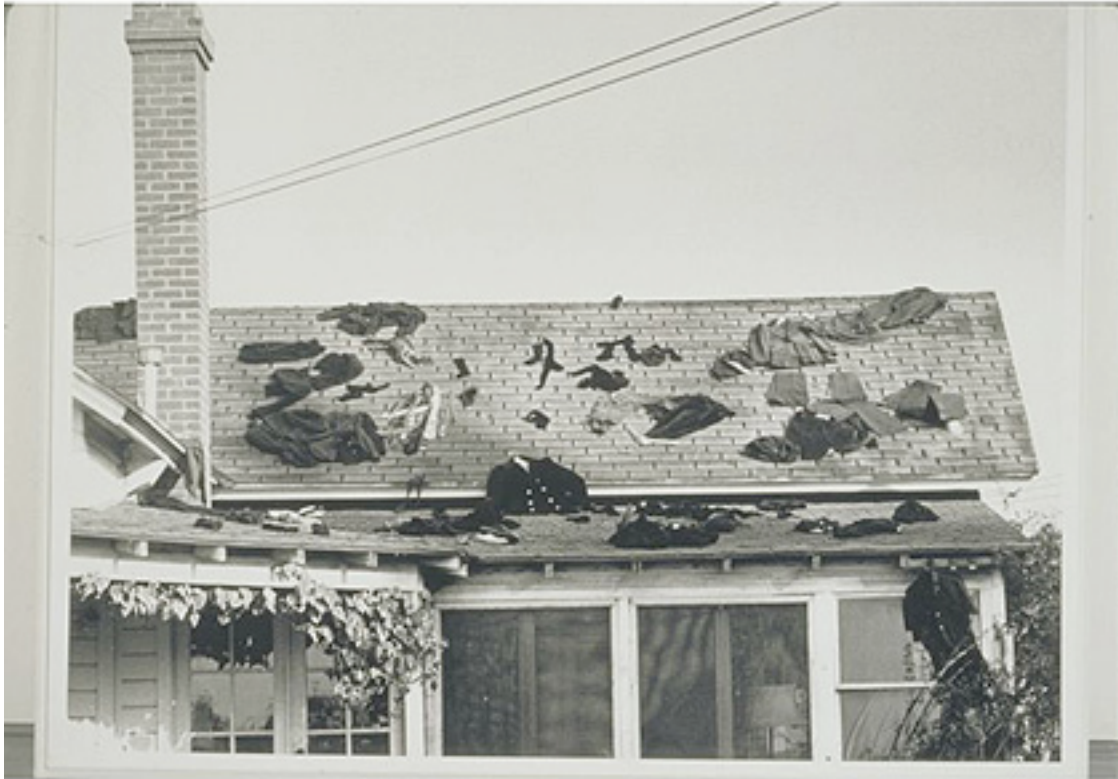
Bas Jan Ader, All My Clothes, 1970

of family history during World War II. After the death of his father, his mother was made to leave her house by Nazi officers with no prior warning. Having no time to pack anything, she threw all the clothes she could reach out the window so that she might gather them up later. 9