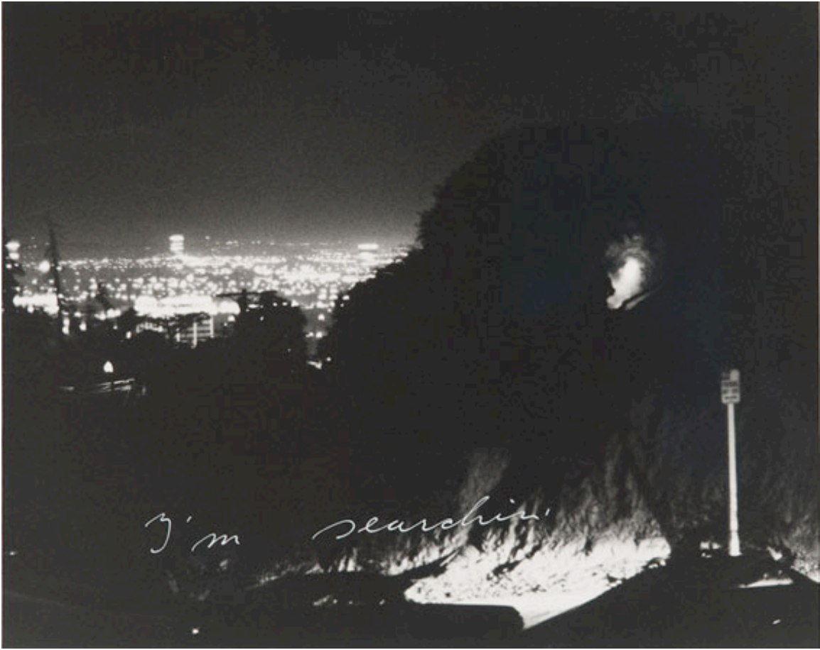
Bas Jan Ader, From In Search of the Miraculous: One Night in Los Angeles , 1973, Courtesy Patrick Painter

displayed, the ritualistic act of the walk retained more significance than its documentation.