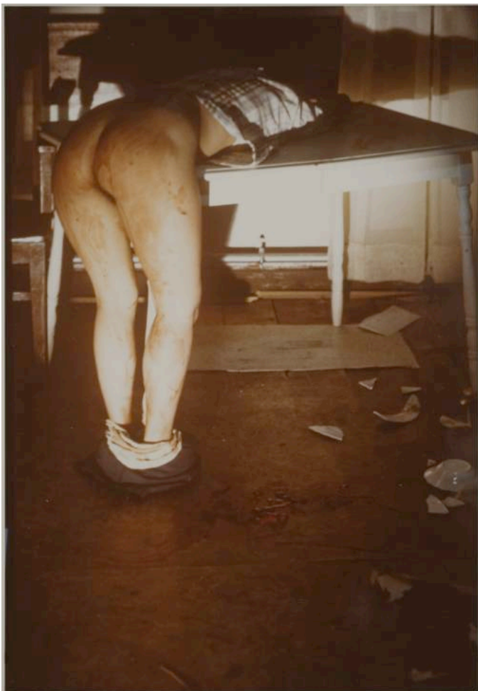
Ana Mendieta, Untitled (Rape Scene), 1973

the University of Iowa addressed the larger issues of sexism and violence, but was prompted by an event from her own life: a fellow student's rape and murder on campus. Following this, unsuspecting artist friends were invited to Mendieta's apartment, where they found her bloody and naked from the waist-down, lying across a tabletop. This was the catalyst for her to begin using violent and provocative images and motifs regularly in her work. Blood became an often used medium, on which she once commented: "I started immediately using blood, I guess because I think it's a very powerful magical thing. I don't see it as a negative force." 11