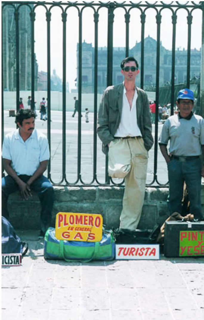
Francis Alÿs, Turista , 1994