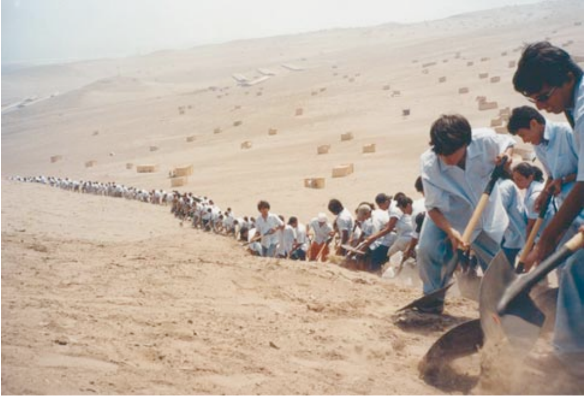
Francis Alÿs, When Faith Moves Mountains , 2002, Courtesy of the Tate Museum

The overall artwork consists of several different elements. One is, of course, the action itself; the fleeting, one-time event that brought Alÿs's idea into life in the real world. When exhibited, When Faith Moves Mountains is usually represented by a 36-minute long video, as well as another shorter "making of" video, documenting various aspects of the preparation and planning for the project in Lima. There also exists photographic documentation, as well as other kinds planning materials, such as a pencil and oil drawing study on tracing paper. (The use of tracing paper is a remnant of Alÿs's training as an architect.) This variety of media is typical of Alÿs's practice, as most of his works exist in several forms, including Alÿs's notes and drawings from his