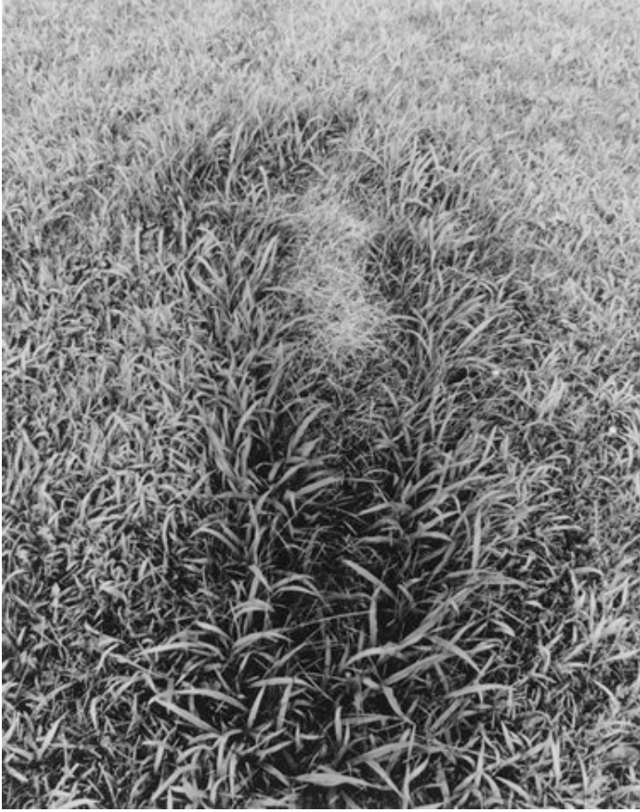
Ana Mendieta, Untitled , from the Silueta Series in Iowa, 1978, Courtesy SF MOMA

The physical aspects of the piece can be read as its referents, but not the only ones. Mendieta is drawing from a whole host of ideas, narratives, and histories that give her specific action meaning. Robert C. Morgan, in the essay “Mistaken Documents: Conceptual Art and Photography”, from his book Art Into Ideas , also discussed the different functions a photograph can take in works of a conceptual nature. He wrote that images can come into being as the result of a process, or they can come as a result of a feeling or ritual. These processes determine how the photograph will function, in either a literal way, as documentation, a poetic way, representing something metaphorical, or a rigid way, as a representation of social codes. Morgan also stated that the inherent structure of a work of a conceptual nature uses a set of criteria that is unrelated to visual