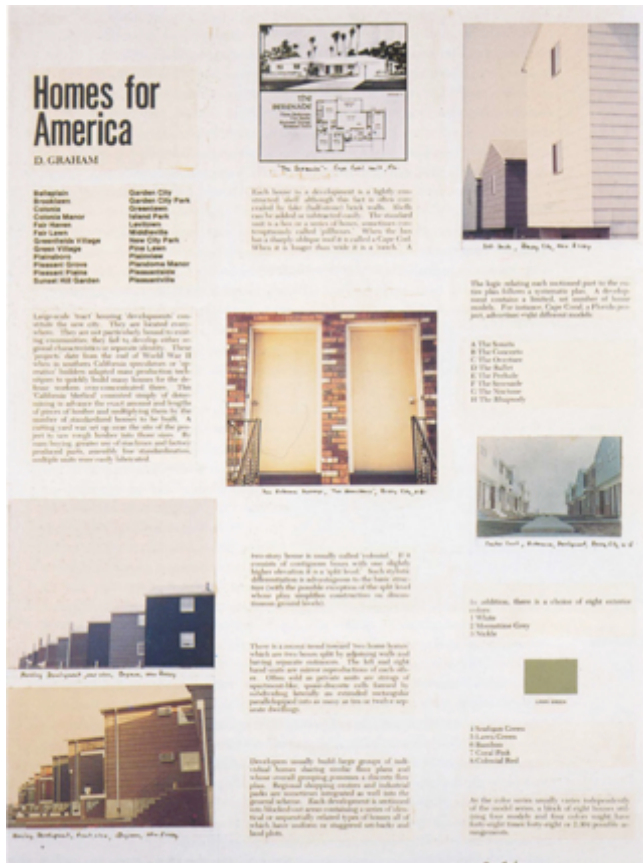
Dan Graham, Homes for America , 1966-67, Arts Magazine

suburban homes, what we would now call “track housing”. Without any knowledge of its context, this work could easily be taken for a serious, factual piece of photo-journalism. 4