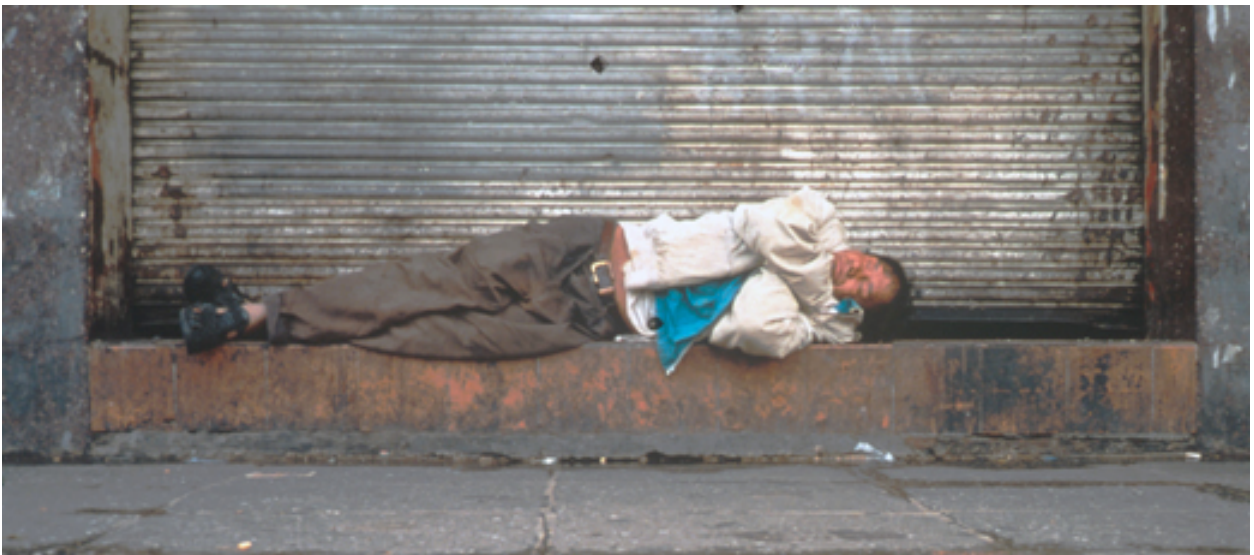
Francis Alÿs, From Sleepers , 1999-Present

is not the primary goal, but it subsequently becomes imbued with importance. The photograph (or video) serves to share the meaning of the action, if not the action itself, with an audience who does not have the privilege of being present. (Although it can be said that this audience is privileged in their distance from the oppressed situations Alÿs engages with.) Sleepers , an ongoing project that began in 1999, consists of photographs of people and dogs sleeping in the urban, public environment – on sidewalks, benches, underpasses. Following a conceptual methodology, the photographs are created based on the guidelines of being on a horizontal plane and being framed level to the subject. These strictures serve the purpose of providing continuity in a long-standing and unfinished project through similarity in aesthetics and subject matter. However, in placing the viewer level with the subject, Alÿs strives to remove any sense of hierarchy in dealing with the homeless: a community that is marginalized and looked down upon. 12