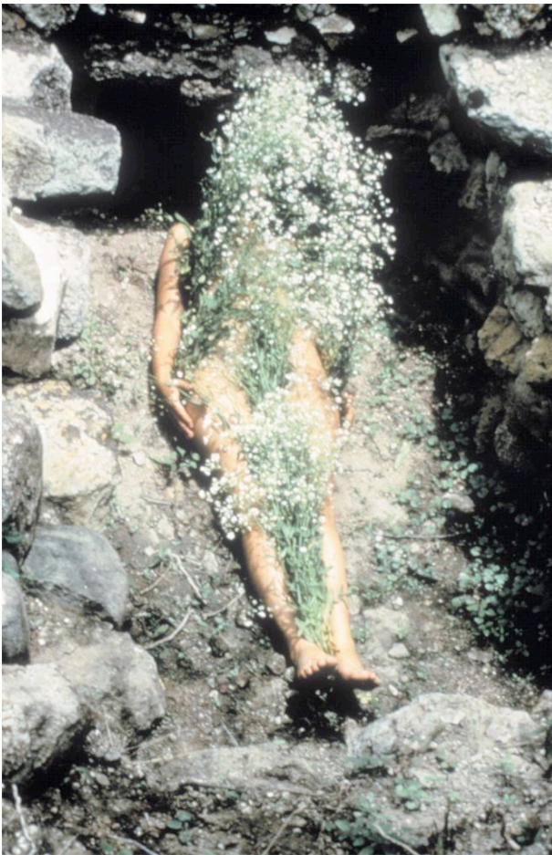
Ana Mendieta, "Imagen de Yagul" from the Silueta Series , 1973

provides a little more information: the intended analogy is that she is covered by both time and history. The choice of the Aztec tomb is deliberate; it is a site marked by a specific cultural history, one that is wrought with the long-reaching effects of colonialism, yet still subject to the natural state of the land. The inherently impermanent nature of the piece also alludes to the power of the site - of deeper cultural truths, which transcend temporality. While admittedly this history is not precisely Mendieta's, it still brought her in closer connection to what she was denied by living in homogenous Iowa. The idea of the ritual was essential to the piece, as her deliberate actions perform the function of healing her wounds and building her identity. 2