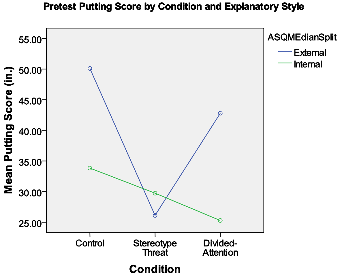
Figure 3. Mean putting score represents only scores from the pretest condition. External participants in the control and divided-attention conditions putted significantly worse in the first trial than any other condition, indicating that they may have been more likely to improve in their second putting trial due to a practice effect.