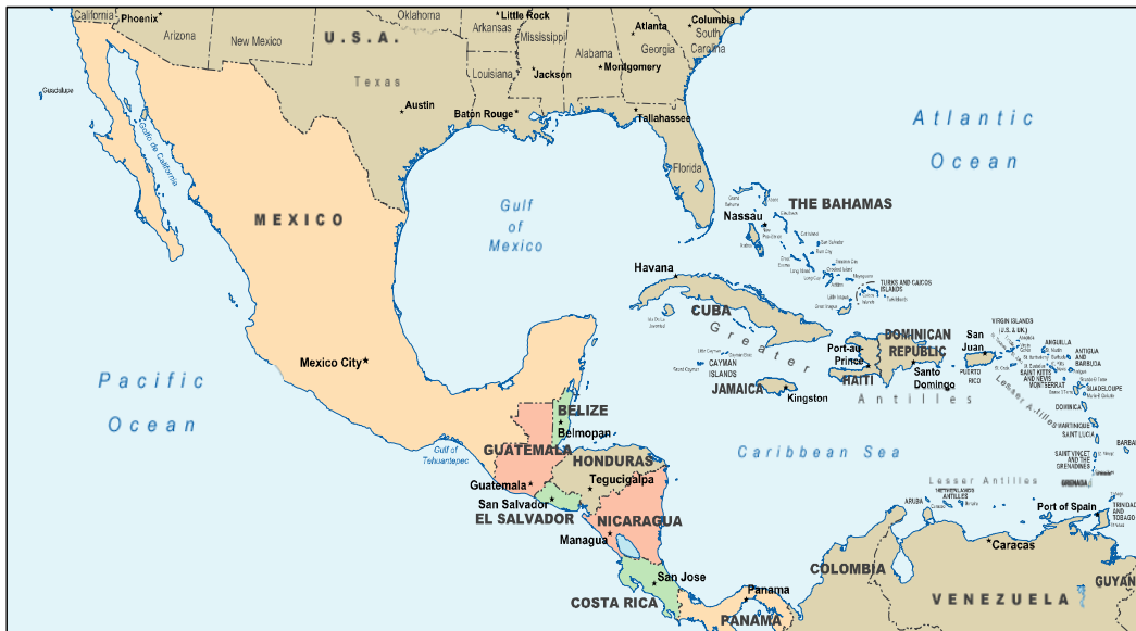
Figure 5. Mexico and Central America