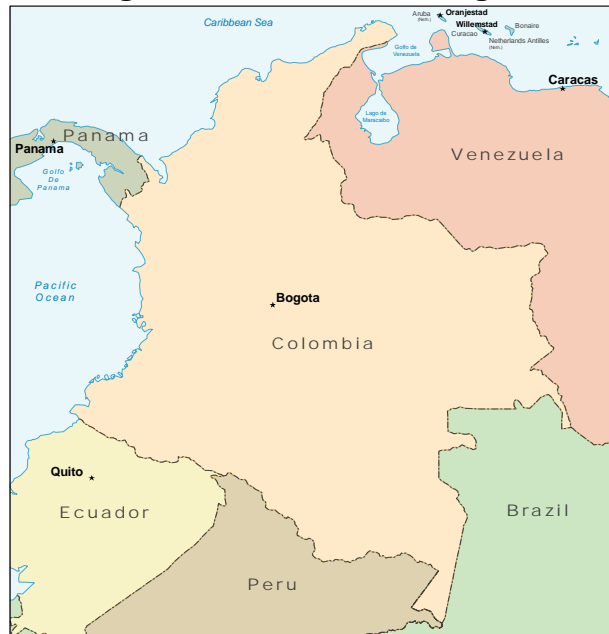
Figure 3. The Andean Region