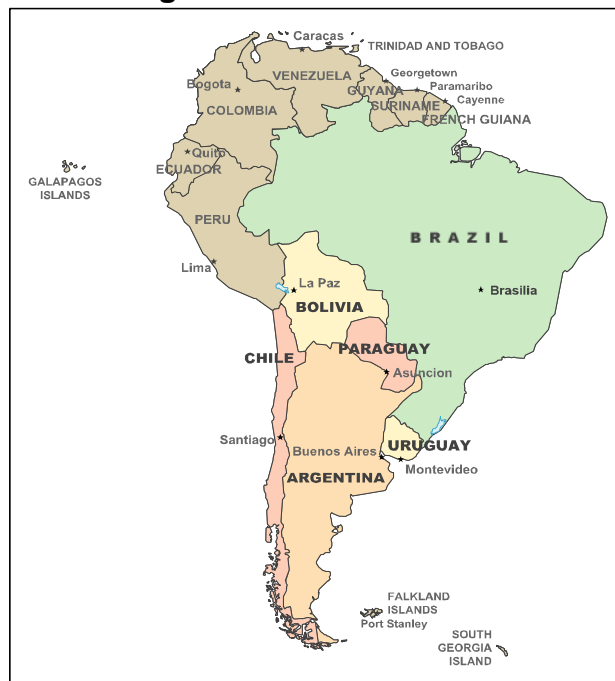
Figure 4. South America

Source: Map Resources. Adapted by CRS. (K.Yancey 4/20/04)