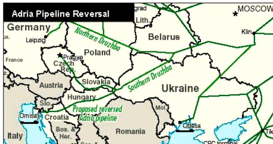
Figure 2. Druzhba and Adria Oil Pipelines

With a 1.2-1.4 million bbl/d capacity, the 2,500-mile Druzhba line is the largest of Russia's oil pipelines to Europe. It begins in southern Russia, near Kazakhstan, where it collects oil from the Urals and the Caspian Sea. In Belarus, it forks at Mozyr, from which one branch runs through Belarus, Poland, and Germany; and the other through Belarus, Ukraine, Slovakia, the Czech Republic, and Hungary ( Figure 2 ). Work has begun to increase capacity between Belarus and Poland. An extension to Wilhelmshaven (Germany) would reduce Baltic Sea tanker traffic and allow Russia to export oil to the United States via Germany.