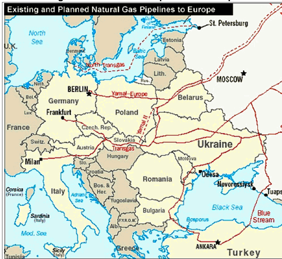
Figure 5. Natural Gas Pipelines to Europe

The Yamal-Europe I pipeline ( Figure 5 , unidentified northern route in Russia), which carries 1 tcf of gas from Russia to Poland and Germany via Belarus, would be expanded under one proposal by another tcf per year. However, Poland and Gazprom disagree on the route of the branch that goes through Poland. Poland wants a route entirely through its own country and then to Germany (Yamal-Europe on the map), while Gazprom is seeking a route via southeastern Poland and Slovakia (Yamal II).