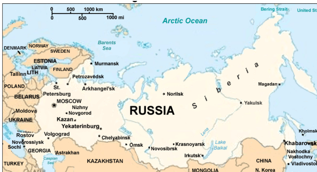
Figure 1. Russia