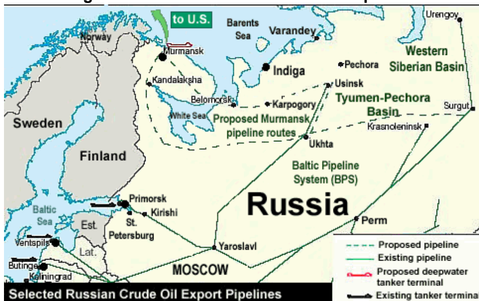
Figure 3. Selected Northwestern Oil Pipelines