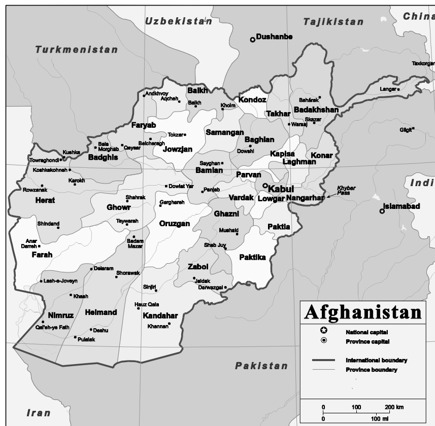
Figure 1. Afghanistan

The U.S.-led effort to end permanently Afghanistan's role as a base for anti-western Islamic terrorists requires not only the defeat of the Taliban—which has been achieved through American, allied, and Afghan military action, but also the reconstruction of a stable, effective and ideologically moderate Afghan state. Otherwise, the country could again become a base for terrorism. Additionally, unless some means is found to organize a relatively stable, multi-ethnic society, the current sharp divisions between the Pushtuns in the South and the Tajiks, Uzbeks, and Hazaras in the North, West, and central Hazarajat region, are likely to have wider repercussions for the stability of Pakistan and the Central Asian states.