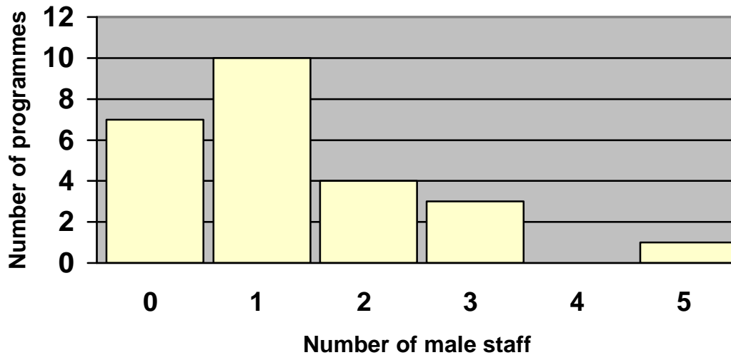
Figure 4.1: Frequency distribution of numbers of male staff employed at 25 Sure Start programmes