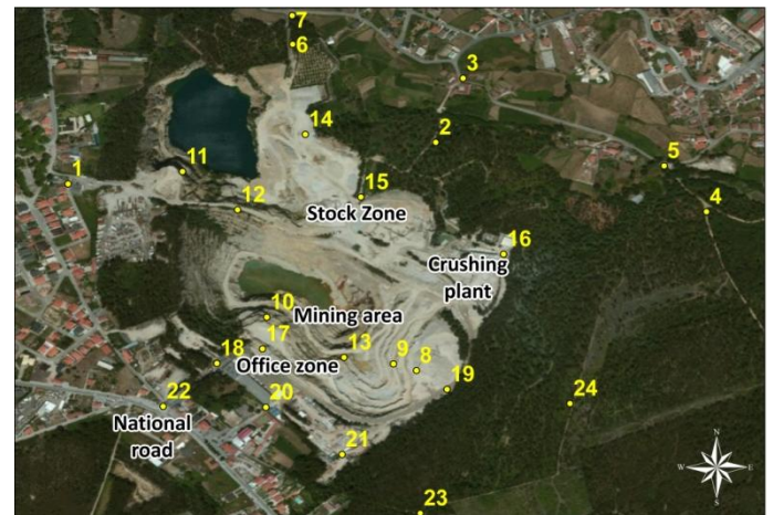
Figure 1. Location of sampling points within and surrounding the quarry.

The second step was to clean the plates with alcohol and then with dichloromethane to remove all the impurities and then, put them in an oven at 105°C for one hour. When the cleaning phase is finished, the plates should be adequately numbered and stored in separate containers for subsequent transport to the sampling site. Although the cleaning procedure is not described in the standard NFX 43 007:2008, the previous version of it, in the year 1973, it is referred that the plates should be dried in the oven at 105°C. The plates are made of stainless steel, with the dimensions of 5 x 10 cm.