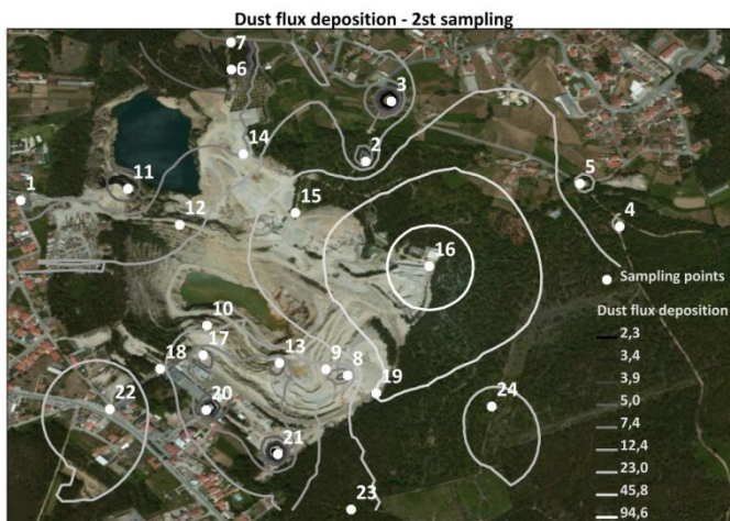
Figure 4. Dust flux deposition for the second sampling.