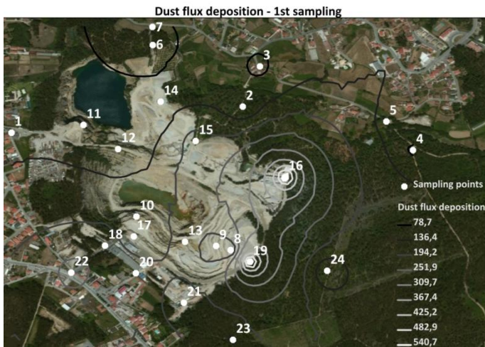
Figure 3. Dust flux deposition for the first sampling.