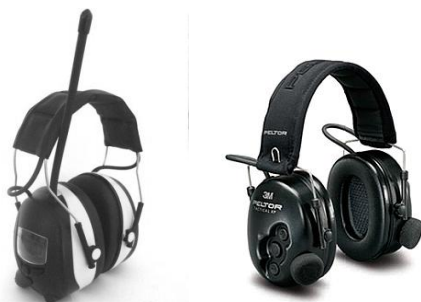
Figure 3-ElectronicHearingProtectorswithMP3orCD players and radio.

There are also with Bluetooth communication function, with microphone fitted with noise filtering, to allow clear communication with other workers even in very noisy environments. Protectors with radio may allow communicating with other radios or mobile phones or connect to CD or MP3 or FM radio for listening to music or news while meeting the priority input external signal communication for security reasons, as exemplified in Figure 3.