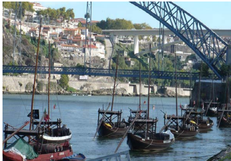
Figure 3: The representation of maritime scenery.

highlights the importance of increased dialogical capacity of entities linked to the promotion of touristic destination in order to involve tourists in the creation of imaginary process, suggesting a guideline of dialogic practices, proposing a set of indicators to be included on the websites of organizations. This study has limitations too. The first limitation is related to the difficulty in obtaining concrete information of the data of the entire population under study. The study of other destination entities linked to accommodation, entertainment, culture and local organizations could have solidified the study, so we leave here the suggestion of future research.