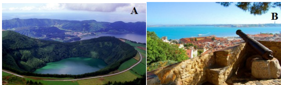
Figure 2 A & B: Extended overview of the destination.