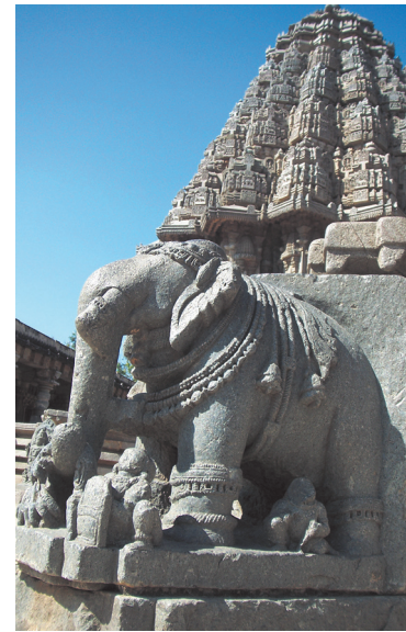
Somnathpur Temple, Bangalore

To download a copy of the GTI 2008 Yearbook and view photos from the study-tour, go to: www.engr.sjsu.edu/about/news/gti-dinner