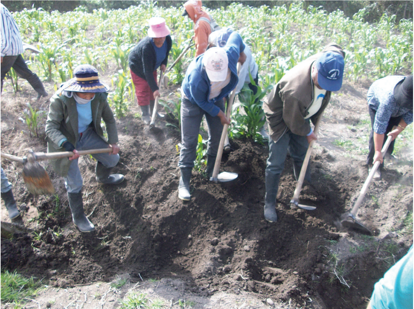
FIGURE 2 Resettlers in a collective work party ( minga ) rebuilding an irrigation network in the high-risk zone at the foot of the volcano. Minga is one of many forms of cooperation and reciprocity practiced in the area.