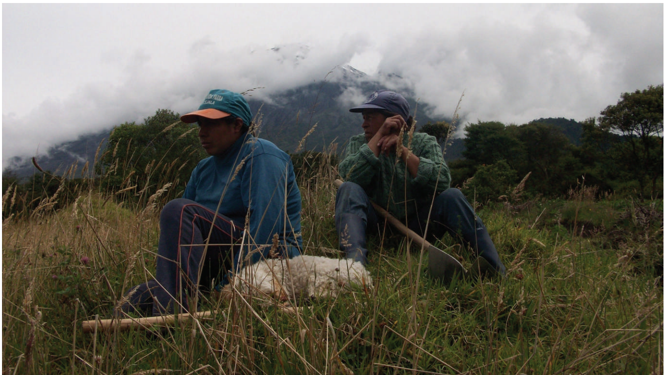
FIGURE 4 Two women in a minga work party take a break from repairing an irrigation canal. Mount Tungurahua can be seen partially obscured by clouds behind them.

The findings from this study can inform mountain development and disaster resettlement and recovery strategies elsewhere, though they do not point to any