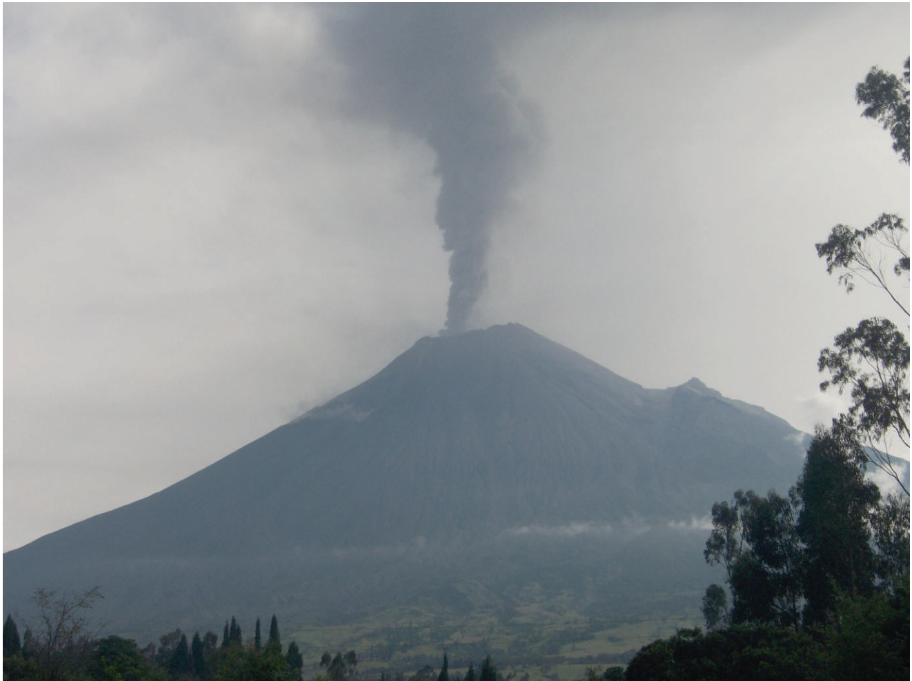
FIGURE 1 Mount Tungurahua eruption in 2011. Throughout November, Mount Tungurahua emitted a large ash column, spilling ash on the crops and on people returning from the resettlement locations to cultivate their lands. Ashfall and other eruptive events have been chronic since the reactivation of the volcano in 1999.

individual households can provide. Moreover, mountain-specific instances of ecologically challenging events such as drought, volcanic activity, and erosion that periodically affect households' abilities to meet subsistence needs are additional incentives for the practices of delayed reciprocal exchange of consumption goods and other forms of mutual aid. Reciprocal exchanges are so pervasive throughout the Andes (Figure 2) that the Quechua terms ayni (dyadic reciprocal exchange) and minga (collective exchange labor) are invoked by peasant and indigenous movements to mobilize resistance to capitalism, state intrusions, and multinational development organizations (Mayer 2005; Colloredo-Mansfeld 2009).