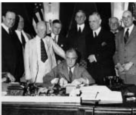
Roosevelt with, to his right and left, respectively, Glass and Steagall.

They provide benefits to savers who couldn't reasonably find and assess borrowers on their own, and to borrowers who would have a hard time finding lenders. Investment banks underwrite securities, meaning they help companies issue new equity (shares of stock) or debt securities (bonds). They perform similar services for state and local governments that wish to issue bonds.