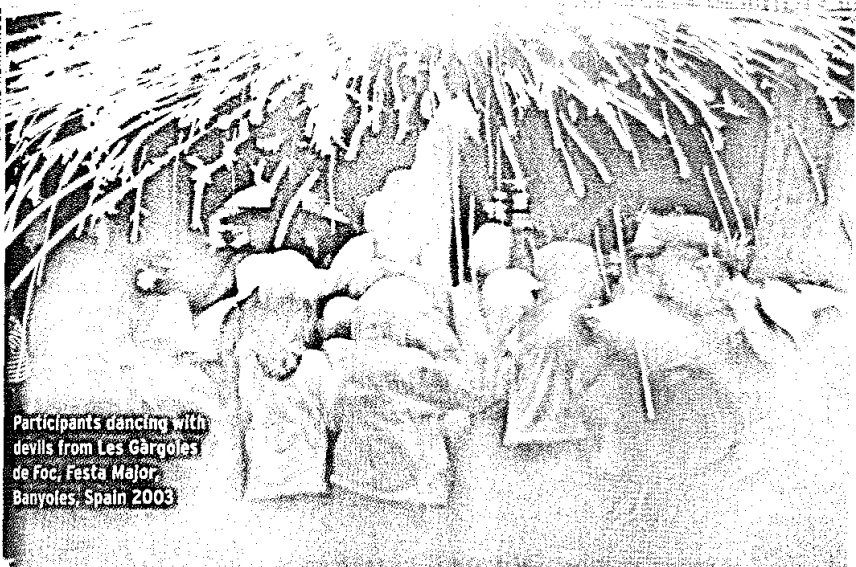
Participants dancing with devils from Les Gargoles de Foc, Festa Major, Banyoles, Spain 2003