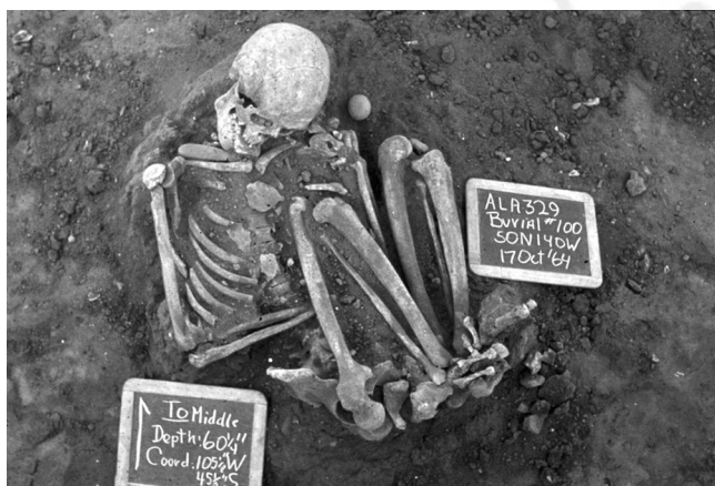
Fig. 2. Example of well preserved skeleton from CA-ALA-329, shown in situ during excavation.