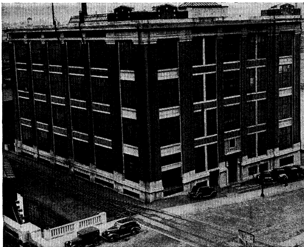
General Laboratory of United States Rubber Company at Passaic, N. J. In this five-story building is carried on research of a fundamental nature for the 27 manufacturing plants, 4 cotton mills, and largest American-owned rubber plantations in the Far East comprising 132,000 acres

staff at Passaic. The others are mailed to various executives or technical workers at the New York office or at our factories on this continent and abroad.