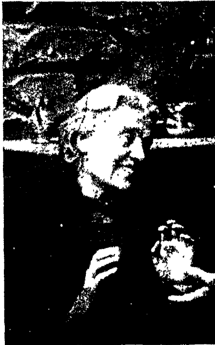
Eleonora Duse in Ceneri produced in 1916 by Ambrosio-Cineart-Film

It should be realized, however, that as regards the bulk of the material in its possession, the Film Library is custodian,